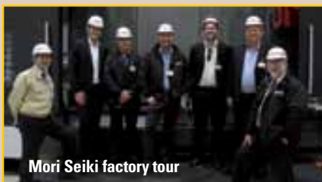
Mori Seiki factory tour