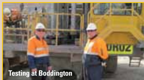
Testing at Boddington

In the second half of 2010 our focus expanded to supplying customers drilling onshore for CSG/CBM in the growing East Coast oil and gas market. Agencies already secured include R&T Controls – Koomey, Integrated Equipment – blow out preventers, Rotary Drilling Tools – API drill pipe, and Logan Oiltools – Bowen fishing tools and power swivels. We are in discussion with Gardner Denver to be their Australian agent for GD mud pumps and spare parts, and with PDC Logic for PDC bits.