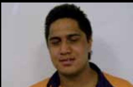
Tamaka Tahu DT Hiload - Heavy Welder