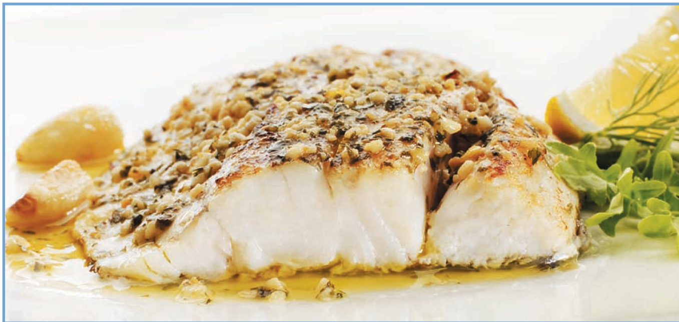
Premium Eco-Star™ Barramundi