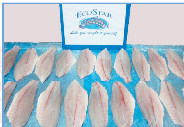
Freshly harvested Eco-Star™ Premium Barramundi fillets

The commencement of Premium Barramundi harvests will result in a significant uplift in revenue for the Company, with the intention to progress towards profitability as production expands from the Thailand operations. Further details of the Company's Thailand expansion plans are outlined later in this edition of Inside Cell.