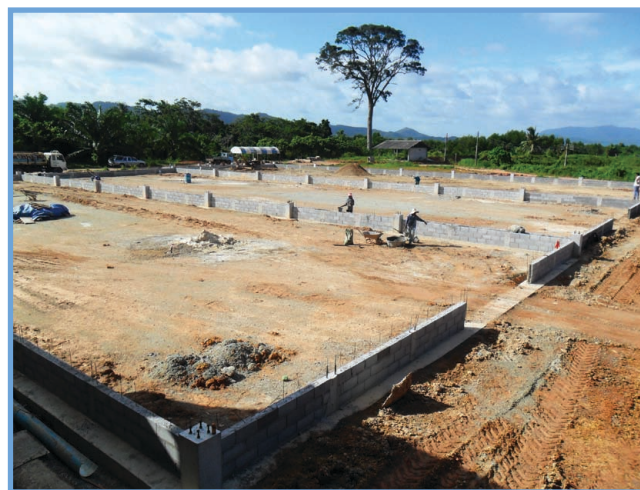
New specialist purpose built 'Cell' production facility under construction

Once completed, the new purpose built 'Cell' facility will be stocked with Premium Barramundi and when harvested, the expanded production capacity will further bolster the Company's revenues, enabling the development of additional national and international markets for the Eco-Star™ product range.