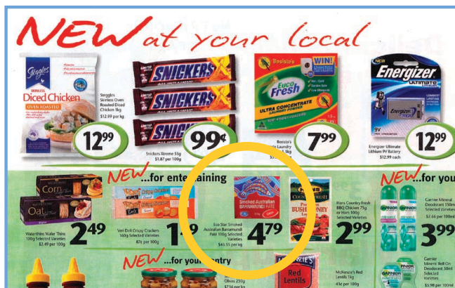
Eco-Star™ Produce featured in a recent IGA Catalogue

As supply strengthens, Cell Aqua's produce is now starting to be featured in IGA's product catalogues. This is greatly assisting the awareness of the products in the marketplace and enhancing the development of the Eco-Star™ brand.