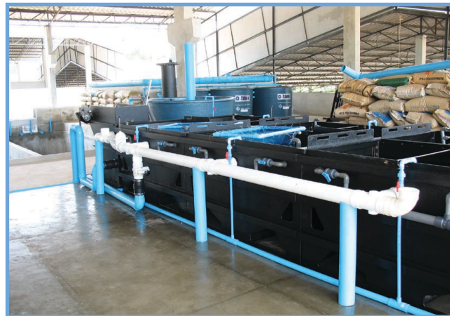
Stage I nursery systems – Currently in production

Once completed, the new purpose built 'Cell' facility will be stocked with Premium Barramundi and when harvested, the expanded production capacity will further bolster the Company's revenues, enabling the development of additional national and international markets for the Eco-Star™ product range.