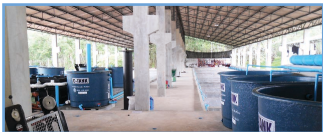
Stage I of Cell Aqua's Barramundi facilities – Currently in production

With Stage I of the Thailand operations now in production, Cell Aqua is progressing the expansion of these operations with the development of a new specialist, purpose built 'Cell' production facility. Construction of the new 'Cell' facility is now well underway and due for completion later in the year.