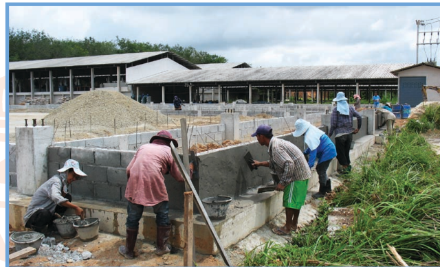
New specialist purpose built 'Cell' production facility under construction