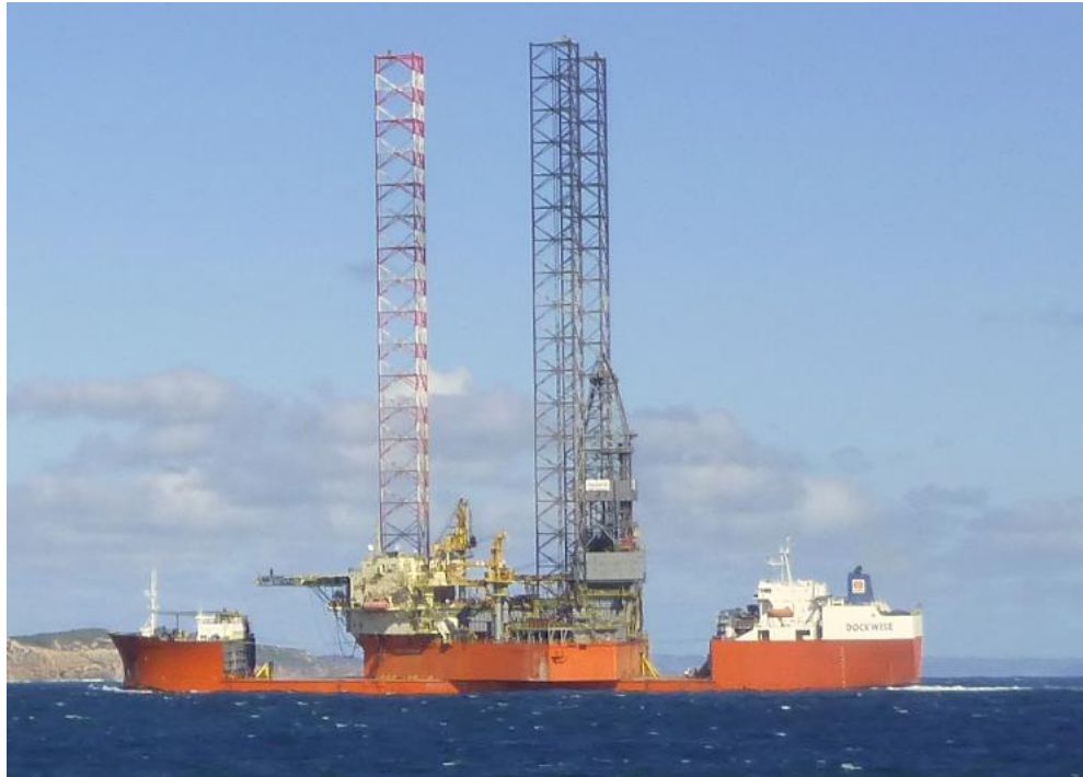
West Telesto being towed on a Heavy Lift Vessel (HLV) into Port Phillip Bay, Melbourne

CHPL currently holds a 55.1% participating interest in VIC/P57 whilst Hirex Petroleum Sdn Bhd (HIREX, a 41% jointly controlled entity of Hibiscus Petroleum) has a 20% interest in VIC/P57. The remaining 24.9% is held by 3D Oil Limited (3D Oil).