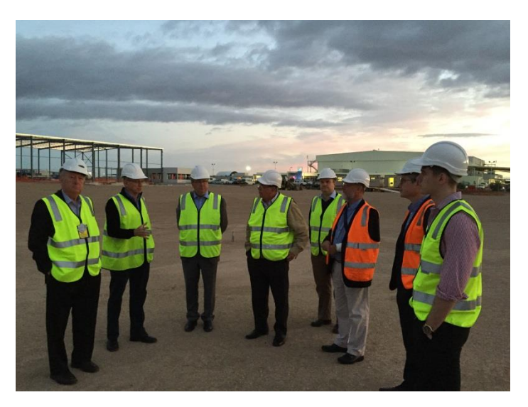
Lindsay Australia Board Members at the Direk Site's construction