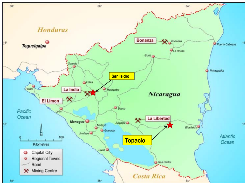
Figure 2 Major Nicaraguan gold deposits and the location of the Topacio Gold Project

Following on from the management changes, on 27 February 2015 the Company announced that it had made a significant acquisition by signing an option agreement with the right to acquire 100% of the advanced Topacio Gold Project that contains a high grade gold deposit with a resource of 340,000 ounces of gold. The Topacio Gold Project is located in southeastern Nicaragua (Figure 2).