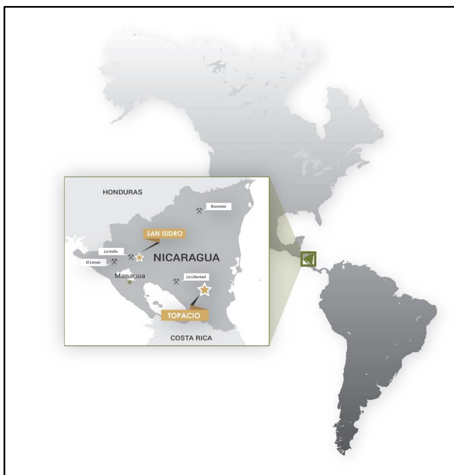
Figure 1 Location of Nicaragua – Central America

The principal terms of the Option Agreement are: