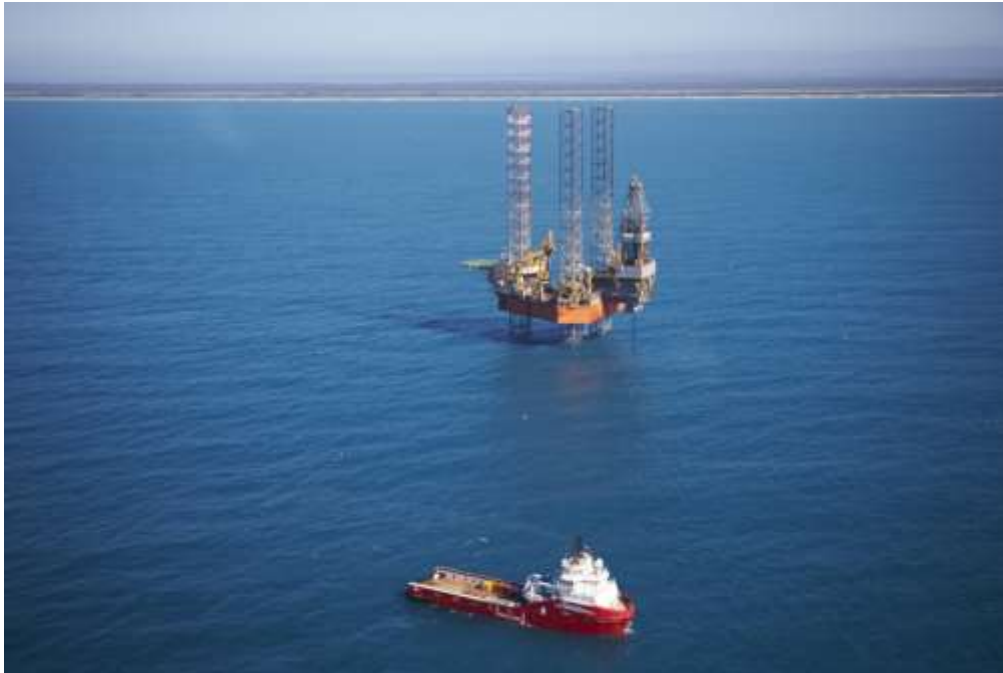
West Telesto drilling rig at the Sea Lion location

Sea Lion is considered highly prospective as it is on a proven oil-producing trend, and represents one of the last undrilled 4-way dip closures at the prolific 'Top Latrobe' level in the Gippsland Basin. The combination of prominent mapped depth structure and the likely presence of thick high quality reservoir sands overlain by the regional seal provides the ingredients of a high quality target.