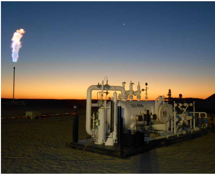
Western Wet Gas Joint Venture with Santos – Yarowinnie South-1 Extended Production Test, October 2015.

The company's FY2016 work program also got underway during the period.