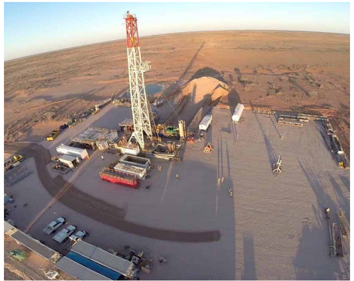
Inland-Cook Oil Fairway – Maroochydhore-1 drill site October 2015.

This year is expected to be another busy year for Drillsearch with up to 22 wells planned across the company's acreage, as well as the tie-in of a number of the company's existing Wet Gas discoveries.