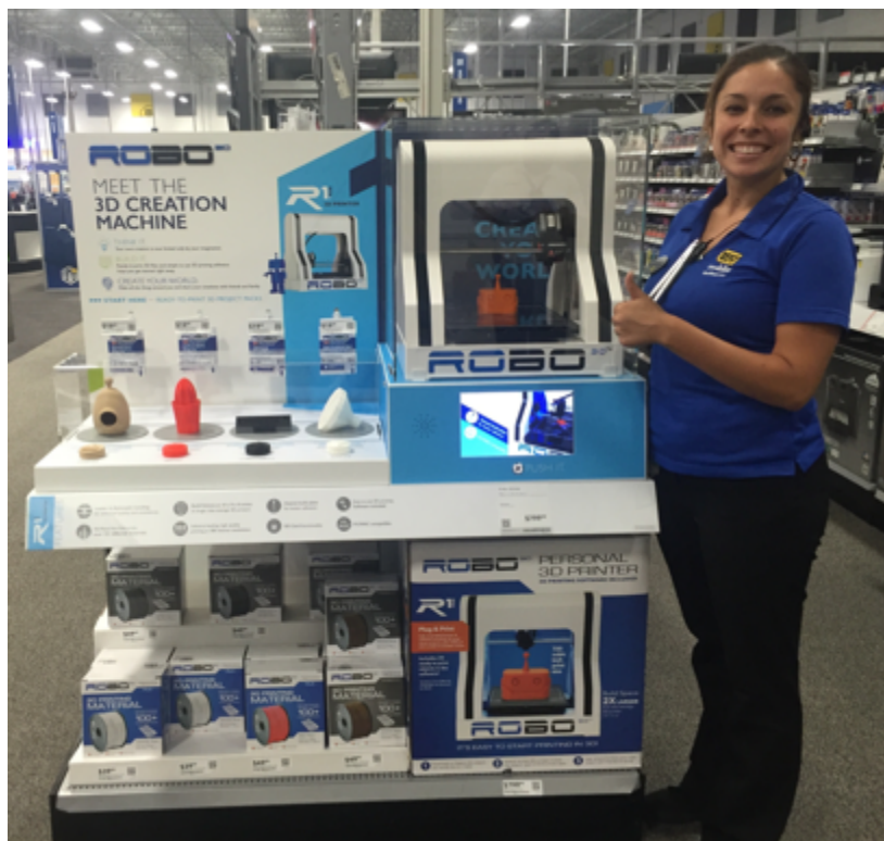
Inset: Best Buy employee standing alongside Robo3D end of aisle display inside Best Buy store.

Prior to October 2015, sales of Robo3D's 3D printers and accessories have been almost exclusively through online sales channels including Robo3D.com, Amazon.com and Bestbuy.com. The bricks and mortar in-store rollout into Best Buy during October 2015 marks a major milestone for Robo3D in its aggressive growth plans. Robo3D's flagship "R1 +Plus" 3D printer has been delivered into 50 selected Best Buy stores throughout the USA. In a major coup for Robo3D, Crowd & Co has also negotiated for Robo3D's products to be displayed at premium "end of aisle" locations across the Best Buy stores.