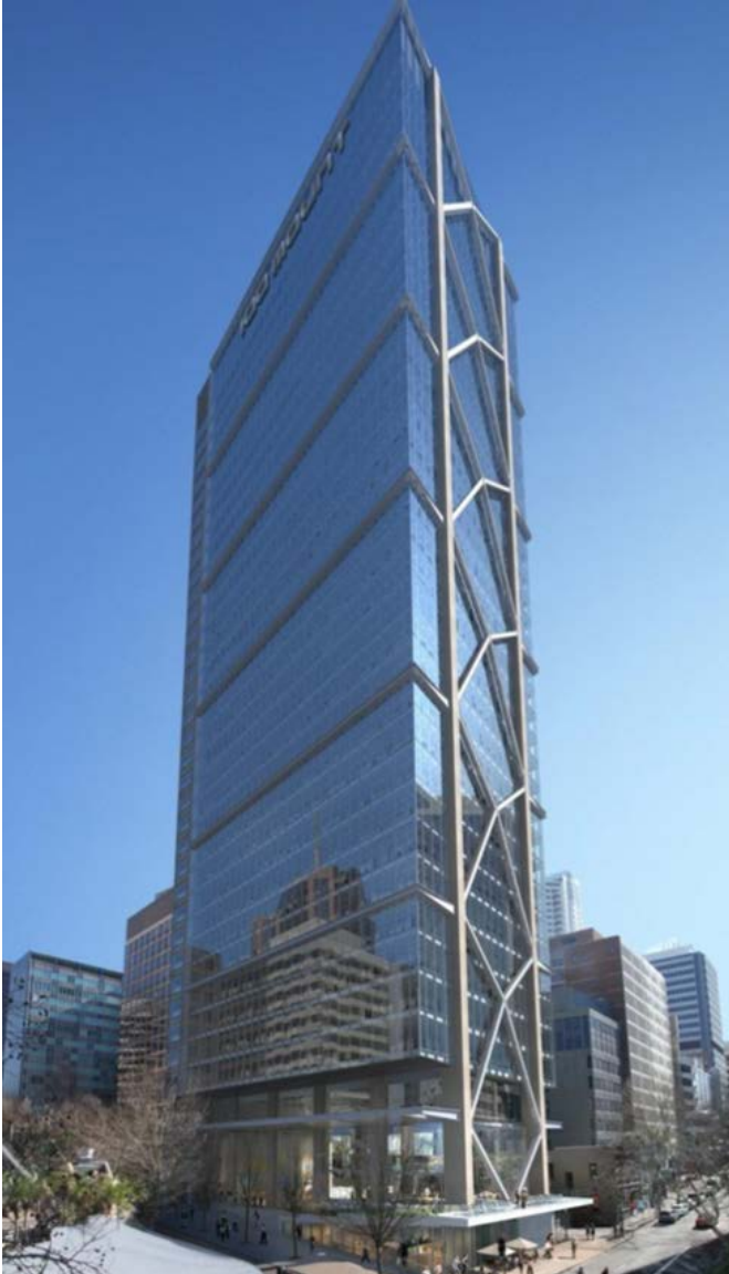
100 Mount Street, North Sydney - Artist's impressions