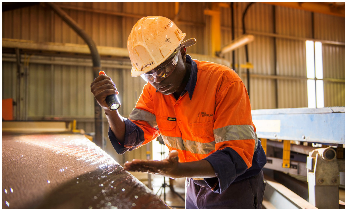
Zircon circuit wet tables

Zircon recovery for the quarter increased from 66% to 69% as a result of wet and dry zircon circuit optimisation, with 76% achieved for the month of March, lifting zircon production to 7,865t (7,507t last quarter). The focus remains on optimising the zircon circuit to achieve the final design recovery of 78% over the coming months.