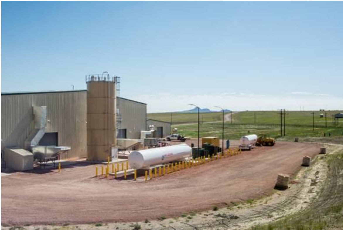
Figure 2: Lance Projects Central Processing Plant