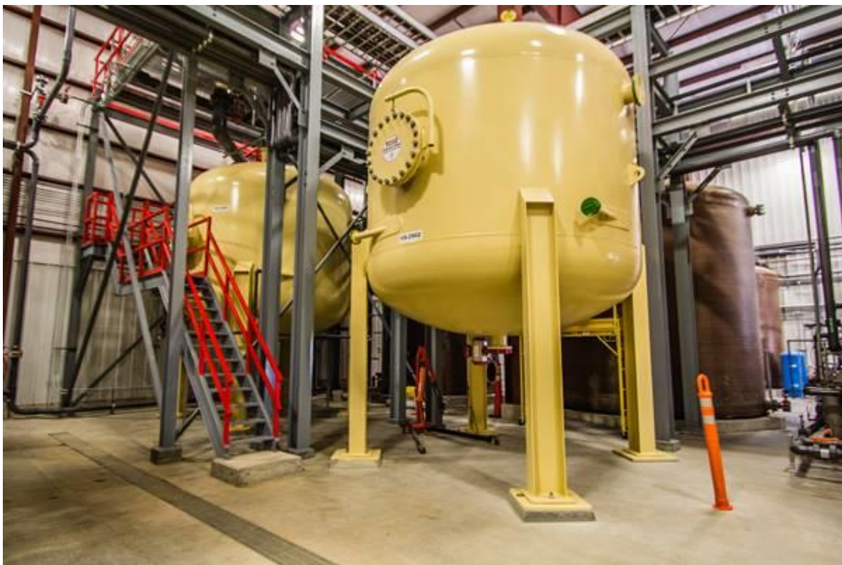
Figure 3: Lance Projects Central Processing Plant (Interior)

Unit 17, Level 2, 100 Railway Road, Subiaco WA 6008,