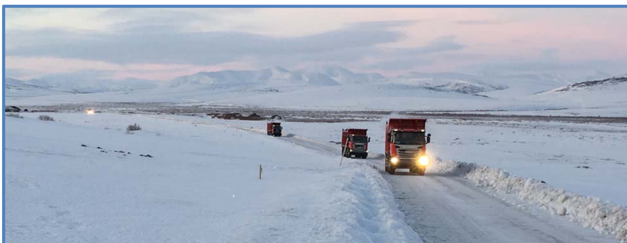
Trucking coal to Port