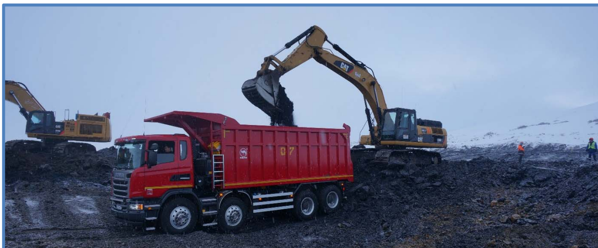
Loading coal in the Project F pit