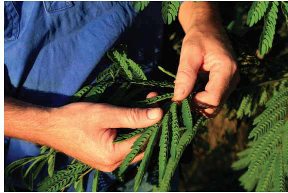
Leucaena (a legume), Rewan, QLD, August 2016

Studies using GPS trackers attached to cattle have shown that on average cattle will stay within 1.2 km of a water source, and that up to 80% of grazing occurs within 2 km of that point.