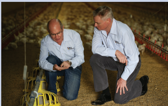
Lighting systems have been installed to simulate dusk and dawn conditions within the sheds. Ground litter is maintained in a dry and friable condition

'Maintaining higher animal welfare standards not only improves the wellbeing of the birds, but has also seen an increase in the bird's ability to cope with extreme weather events, overall healthier chickens and facilitates safer working conditions for staff', Mr Shields said.