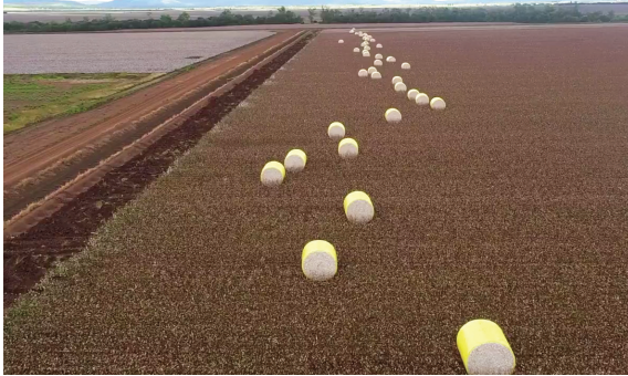
Baled raw cotton on Lynora Downs, ready for delivery to Queensland Cotton for ginning, March 2017