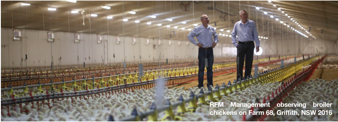
RFM Management observing broiler chickens on Farm 68, Griffith, NSW 2016