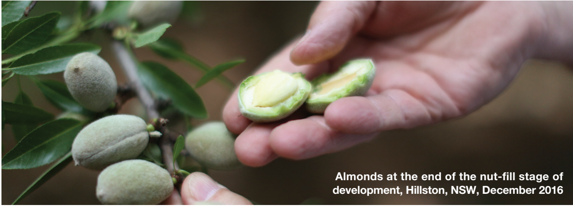
Almonds at the end of the nut-fill stage of development, Hillston, NSW, December 2016