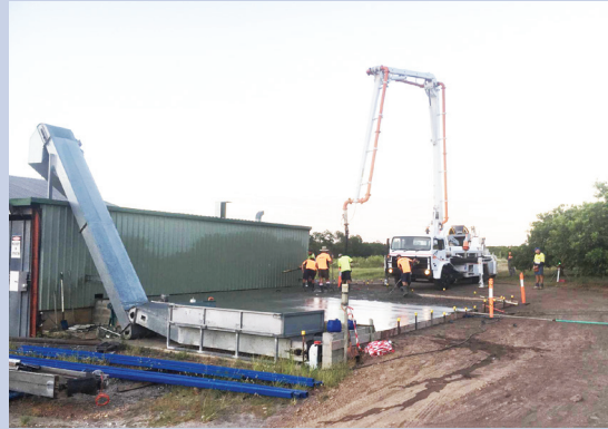
Construction work on stage 1 of the de-husking shed upgrade

In addition to this upgrade, RFF has funded the automation of irrigation systems at the Swan Ridge and Moore Park orchards. This allows for more accurate control and monitoring of irrigation from a central location. This upgrade benefits growers through the reduction of labor costs, improvements in water efficiency and the ability to use off-peak electricity.