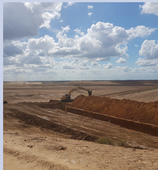
Earthmoving equipment constructing the new water storage area, April 2017

Lynora Downs sits in a water catchment area totalling around 5,000 kms 2 and one of the advantages of the property is that it is located upstream in the water catchment area, receiving flows before any other property. It is planned to complete the development by the end of November, with most of the property's 638 mm of rainfall expected to be received over the summer months.