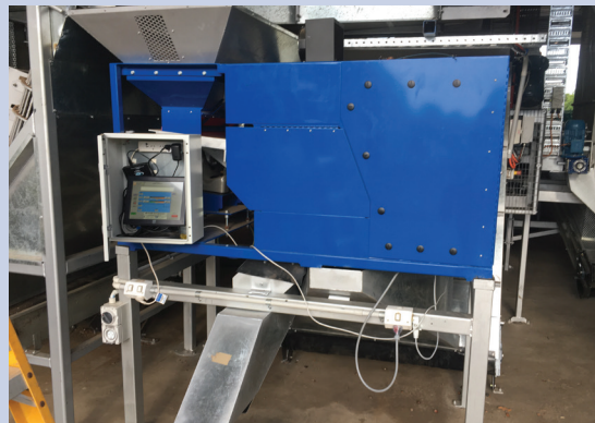
The newly installed colour sorter, which rejects any discoloured NIS, reduces the requirement for manual sorting

RFM management has reported that performance of the completed upgrades to date have outperformed expectations, with throughput capacity double that of the previous system.