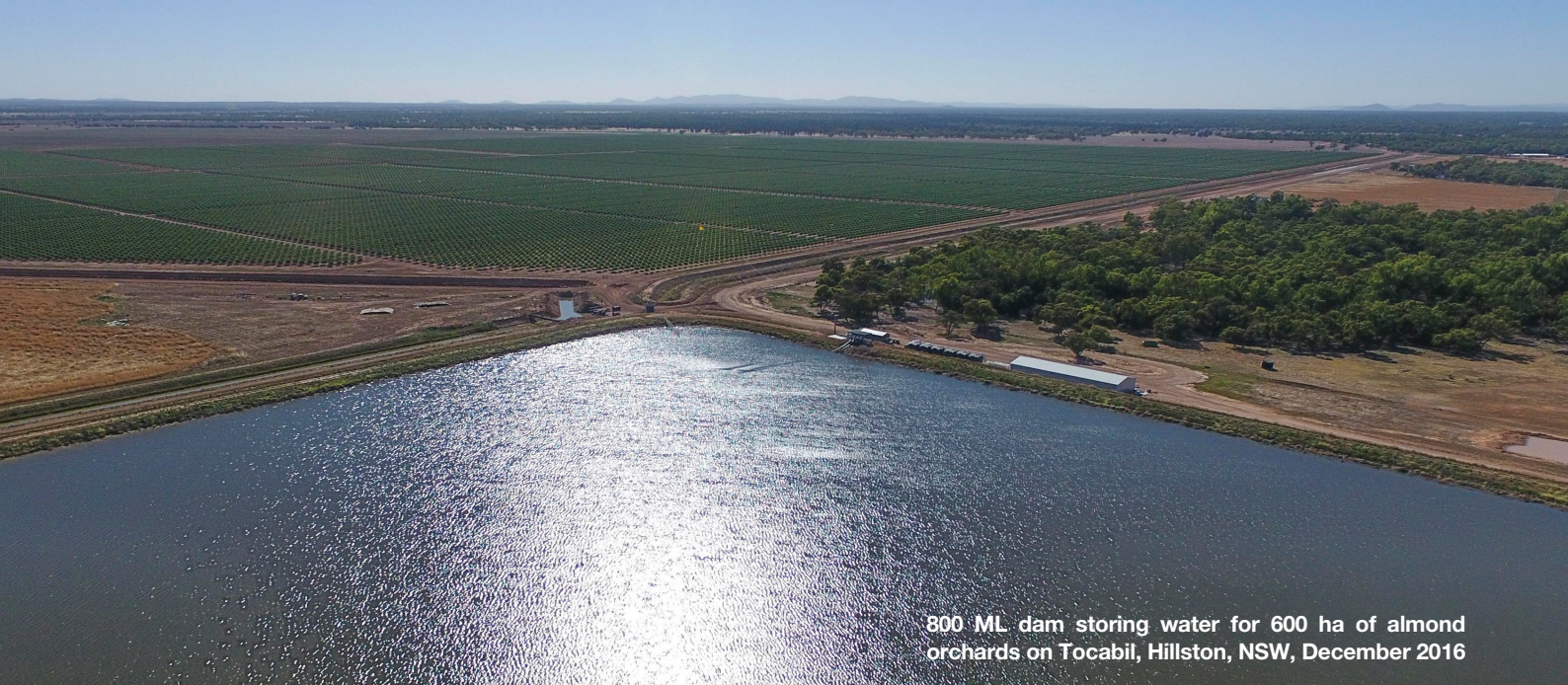
800 ML dam storing water for 600 ha of almond orchards on Tocabil, Hillston, NSW, December 2016