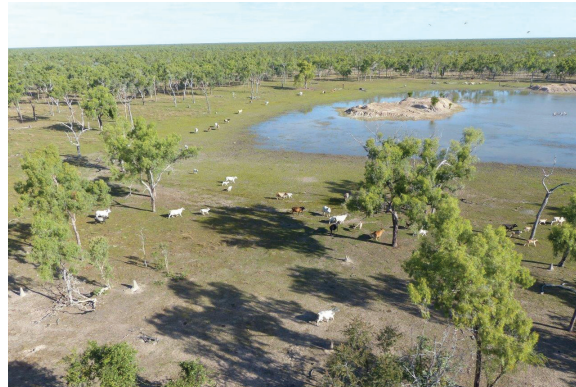
Brahman cattle grazing near a watering point, Mutton Hole, QLD, August 2016

Energy, the second limiting factor, is absorbed from grasses, primarily through the fermentation process occurring in the rumen. This process is maintained by microbes that reside there in incredible numbers and diversity. For each millilitre of rumen fluid there are around 10 billion bacterial cells of 200 differing species, plus protozoa, much larger but less numerous single cell organisms. This vast army of microbes, held in a solution of saliva supplied at 125 litres per day, process plant cellulose into sugars and volatile fatty acids that create energy to sustain this process and enable animal growth or weight gain. This complex process is the consequence of a symbiosis between the host animal and the vast microbial population residing within it, and is an example of the diffusion and interconnection of life described by Humboldt and Darwin.