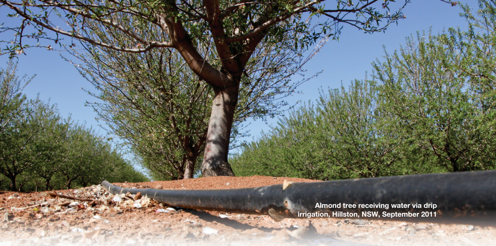
Almond tree receiving water via drip irrigation, Hillston, NSW, September 2011

As at 31 December 2016, RFF held water entitlements representing a fair value of $152.7m, with the majority held in the Southern Murray-Darling Basin. RFF also holds water rights in the Fitzroy Basin and Burnett River Catchment in central and southeast Queensland. Table 1 outlines RFF's water assets as of April 2017.