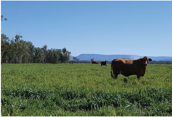
Cattle grazing on forage crops, Rewan, QLD, August 2016