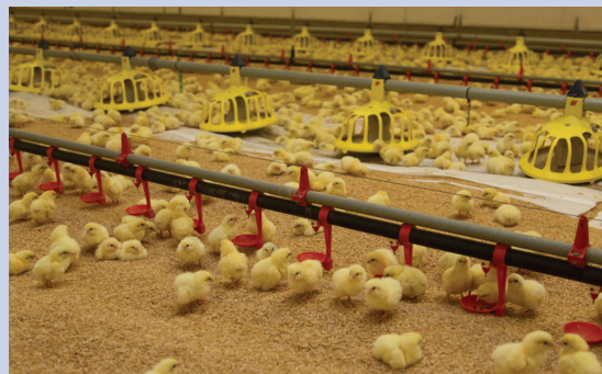
Stocking density has been reduced from 38–40 kg/m 2 down to 34–36 kg/m 2