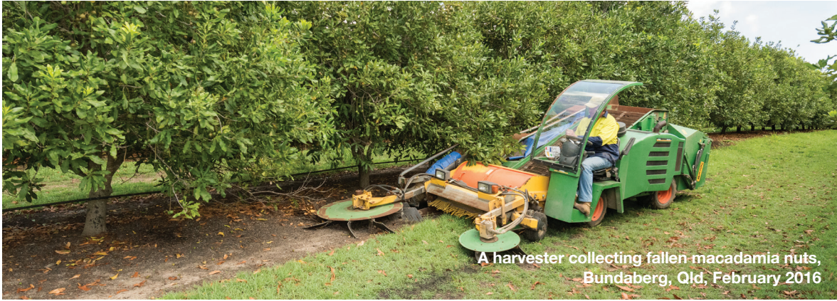
A harvester collecting fallen macadamia nuts, Bundaberg, Qld, February 2016