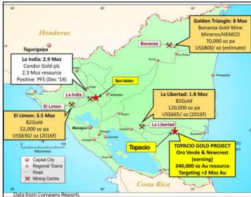
Figure 2 Major Nicaraguan gold deposits and the Topacio Gold Project