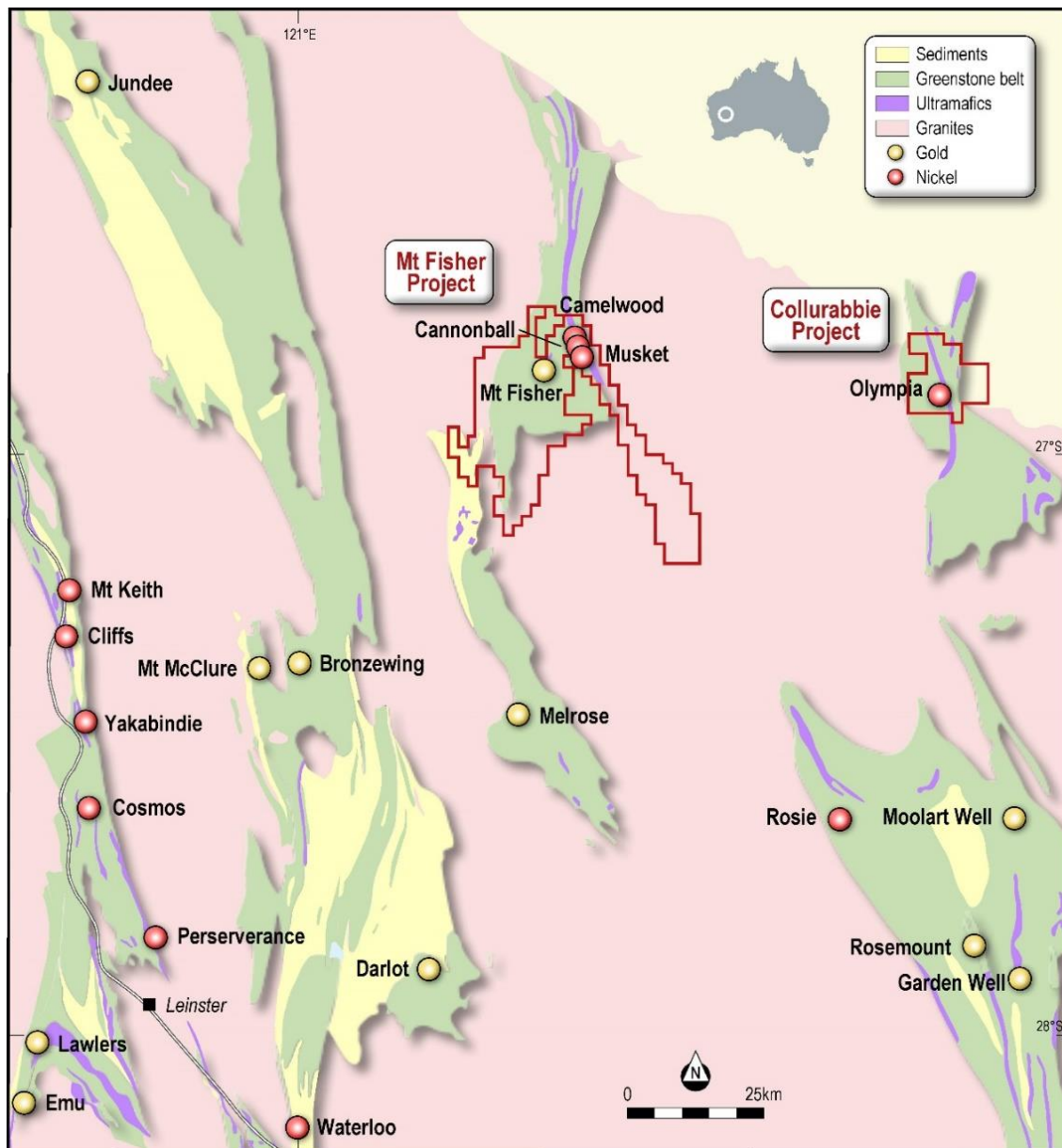
Figure 1: Collurabbie Project Location Map