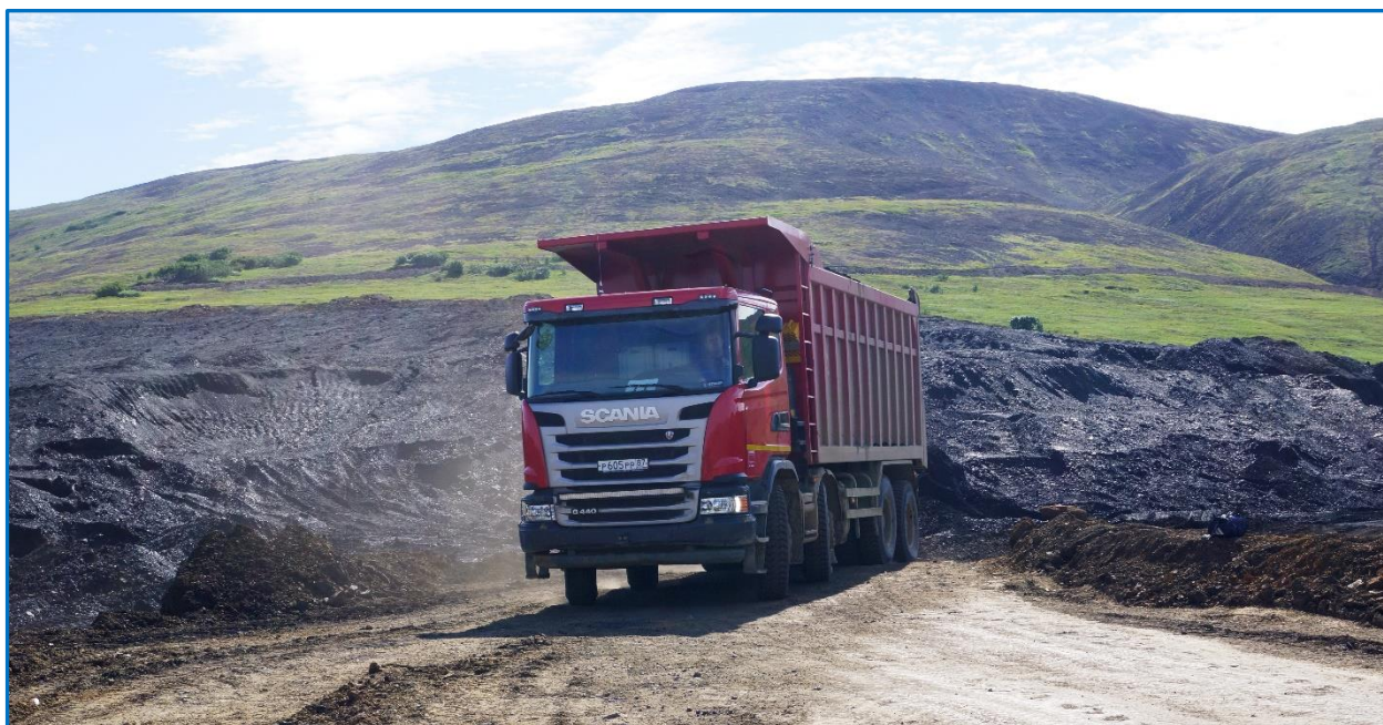
Loaded haul truck leaving the open pit