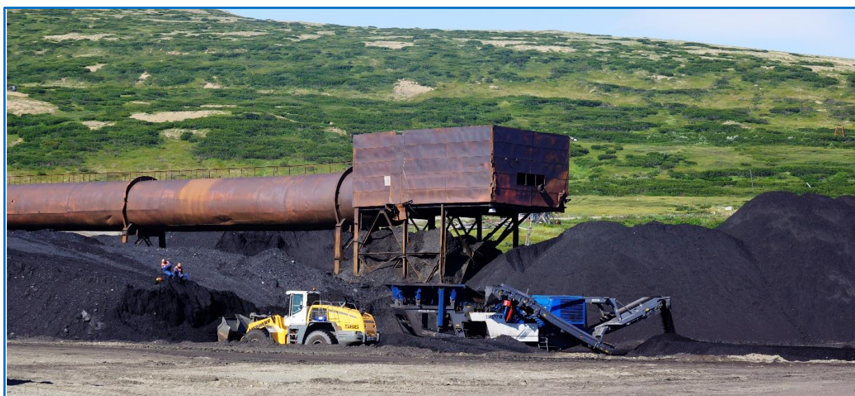
Coal crushing operations at the port stockpiles