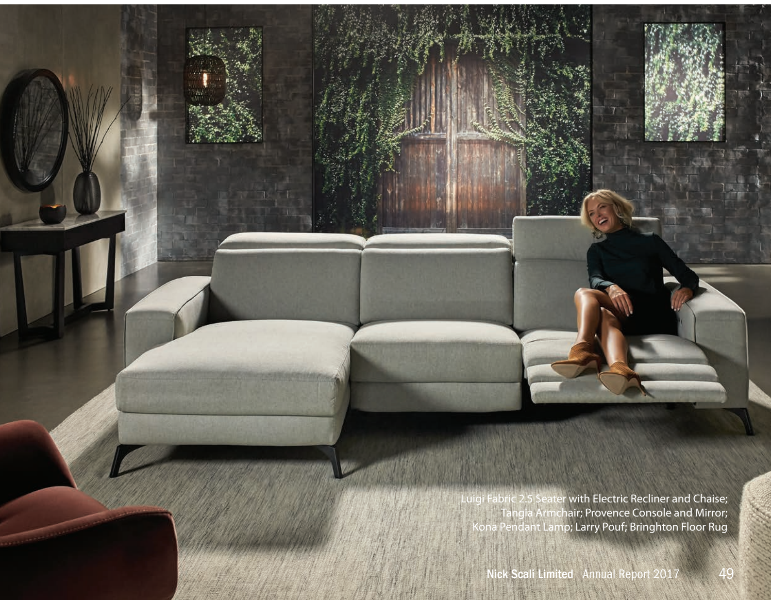
Luigi Fabric 2.5 Seater with Electric Recliner and Chaise; Tangia Armchair; Provence Console and Mirror; Kona Pendant Lamp; Larry Pouf; Brighton Floor Rug

There are no other classes of equity securities.