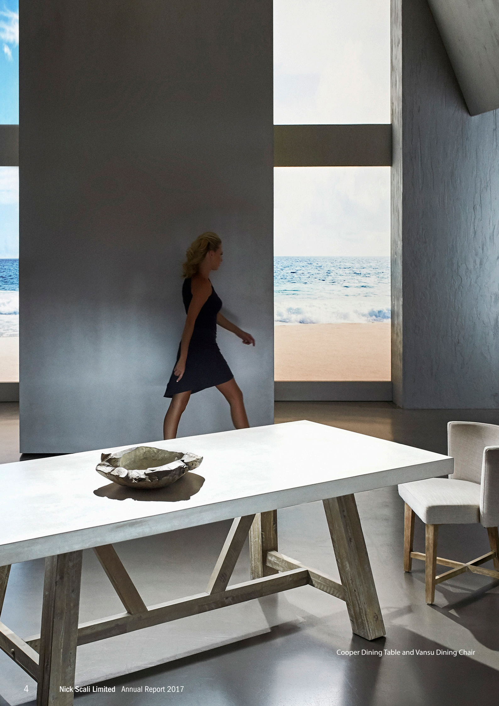
Cooper Dining Table and Vansu Dining Chair