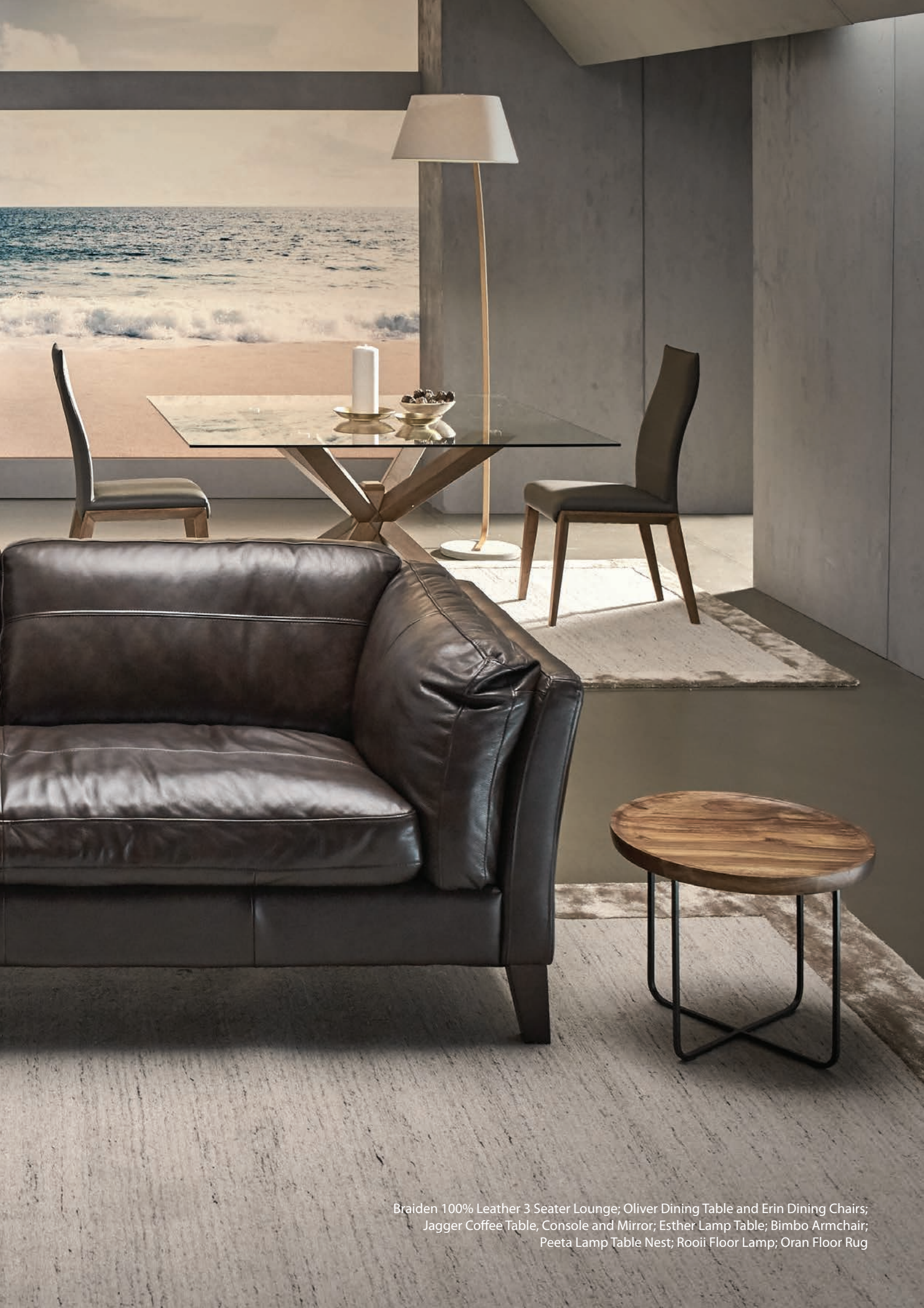
Braiden 100% Leather 3 Seater Lounge; Oliver Dining Table and Erin Dining Chairs; Jagger Coffee Table, Console and Mirror; Esther Lamp Table; Bimbo Armchair; Peeta Lamp Table Nest; Rooii Floor Lamp; Oran Floor Rug