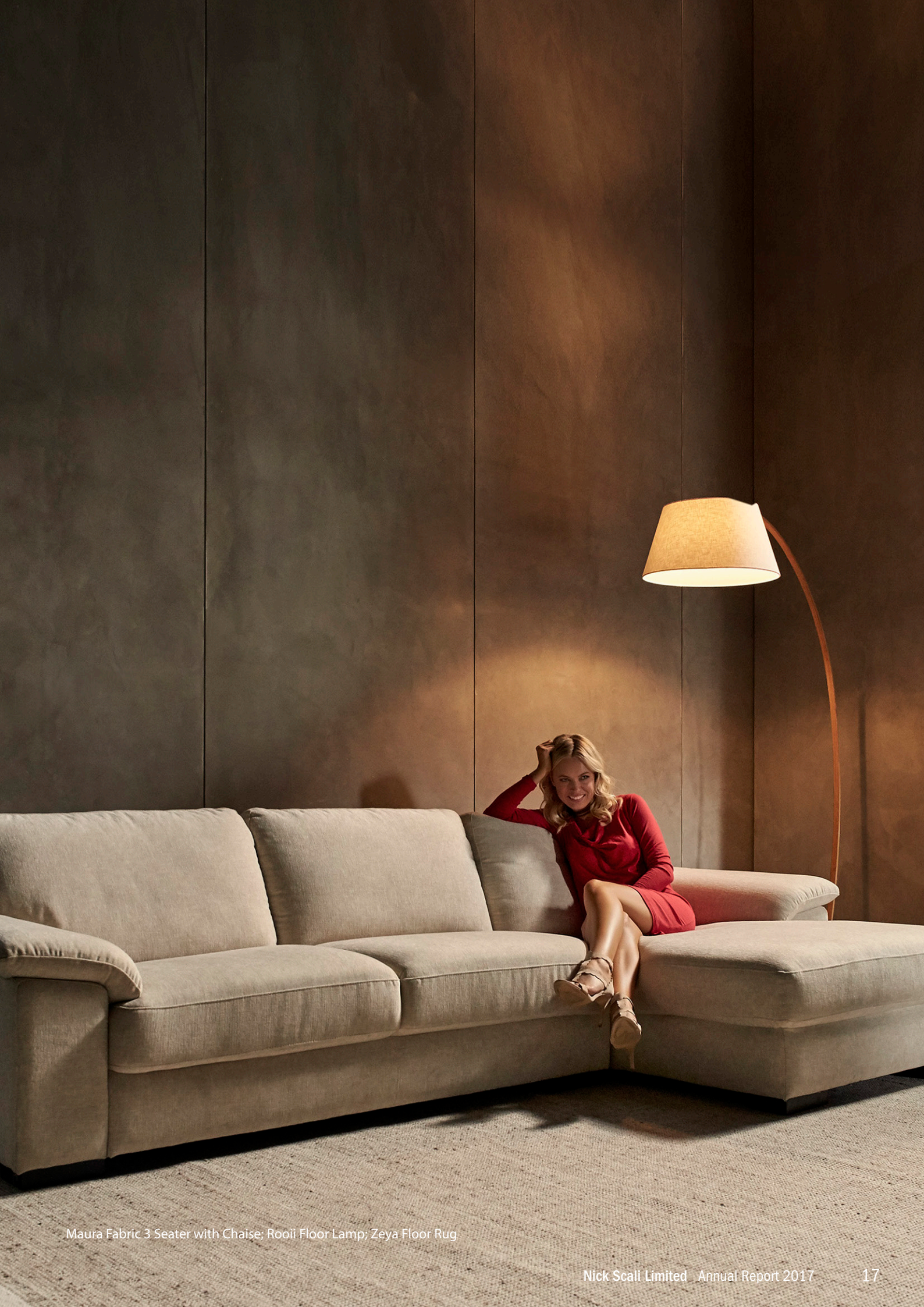
Maura Fabric 3 Seater with Chaise; Rooii Floor Lamp; Zeya Floor Rug