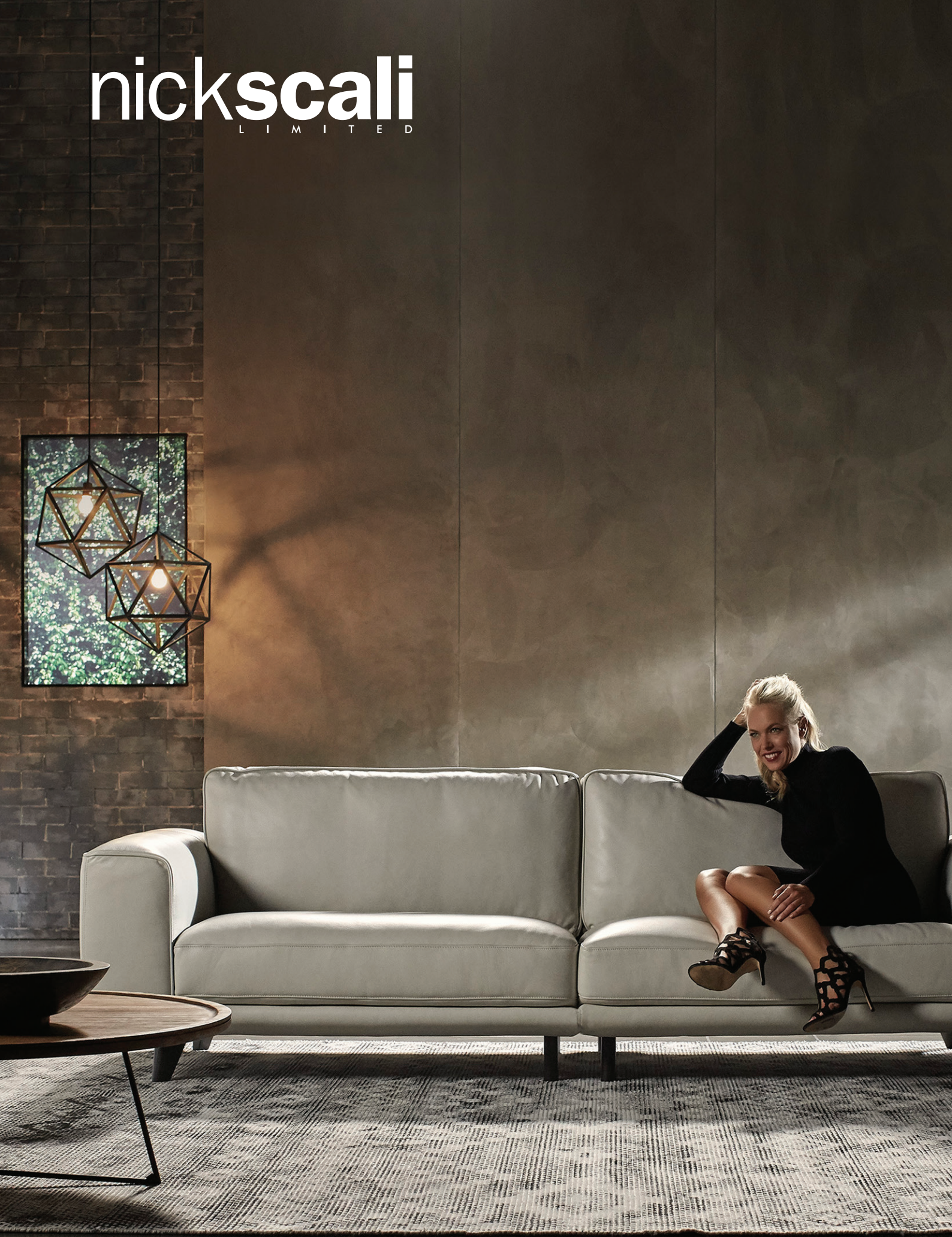
Turin 100% Leather 4 Seater Lounge; Inma Coffee Table; Yolmen Pendant Lamps; Berta Floor Rug