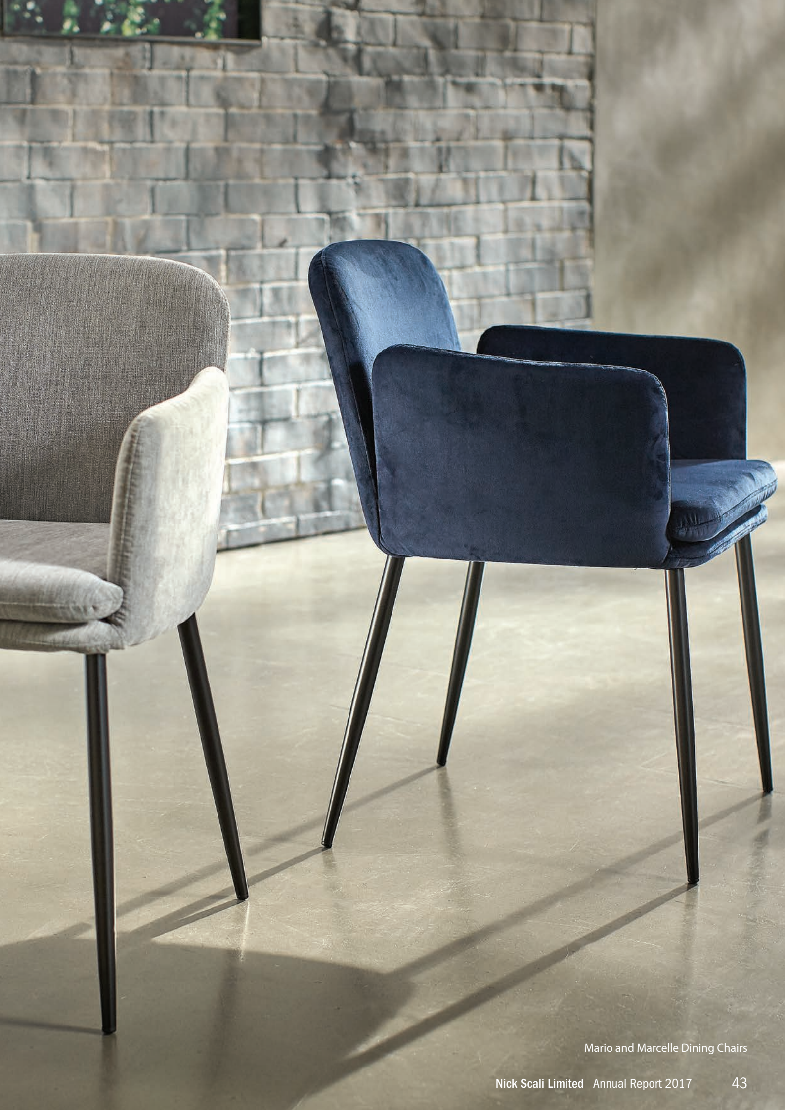
Mario and Marcelle Dining Chairs