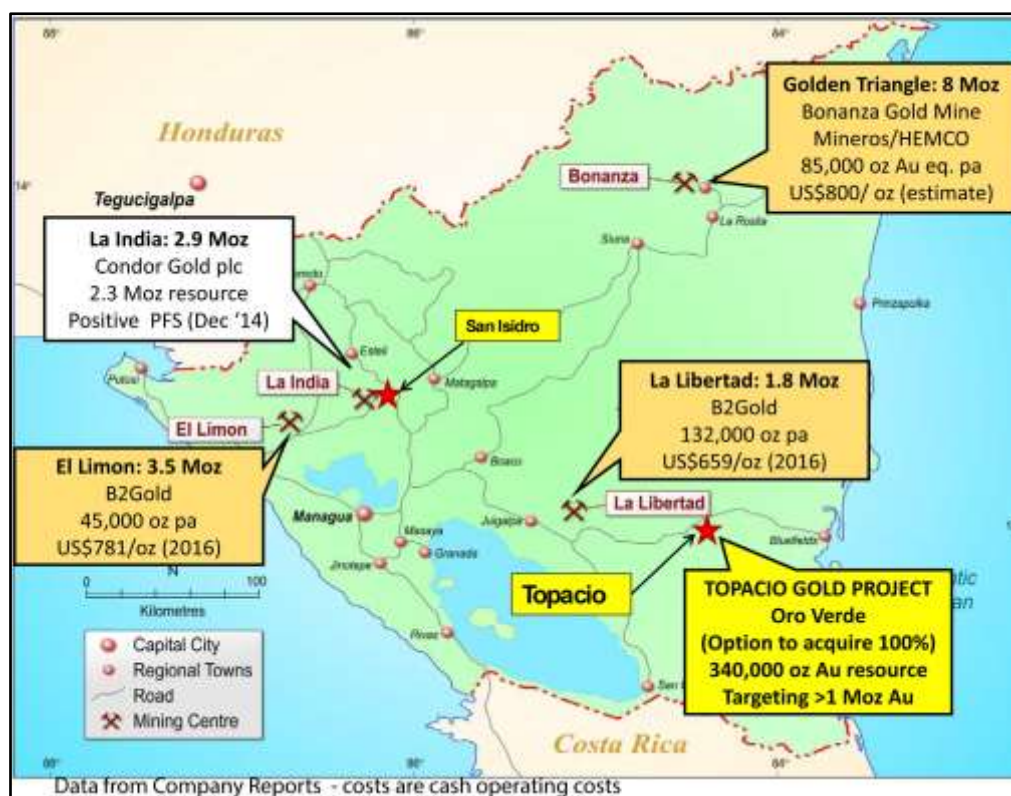
Figure 3 Major Nicaraguan gold deposits and the Topacio Gold Project