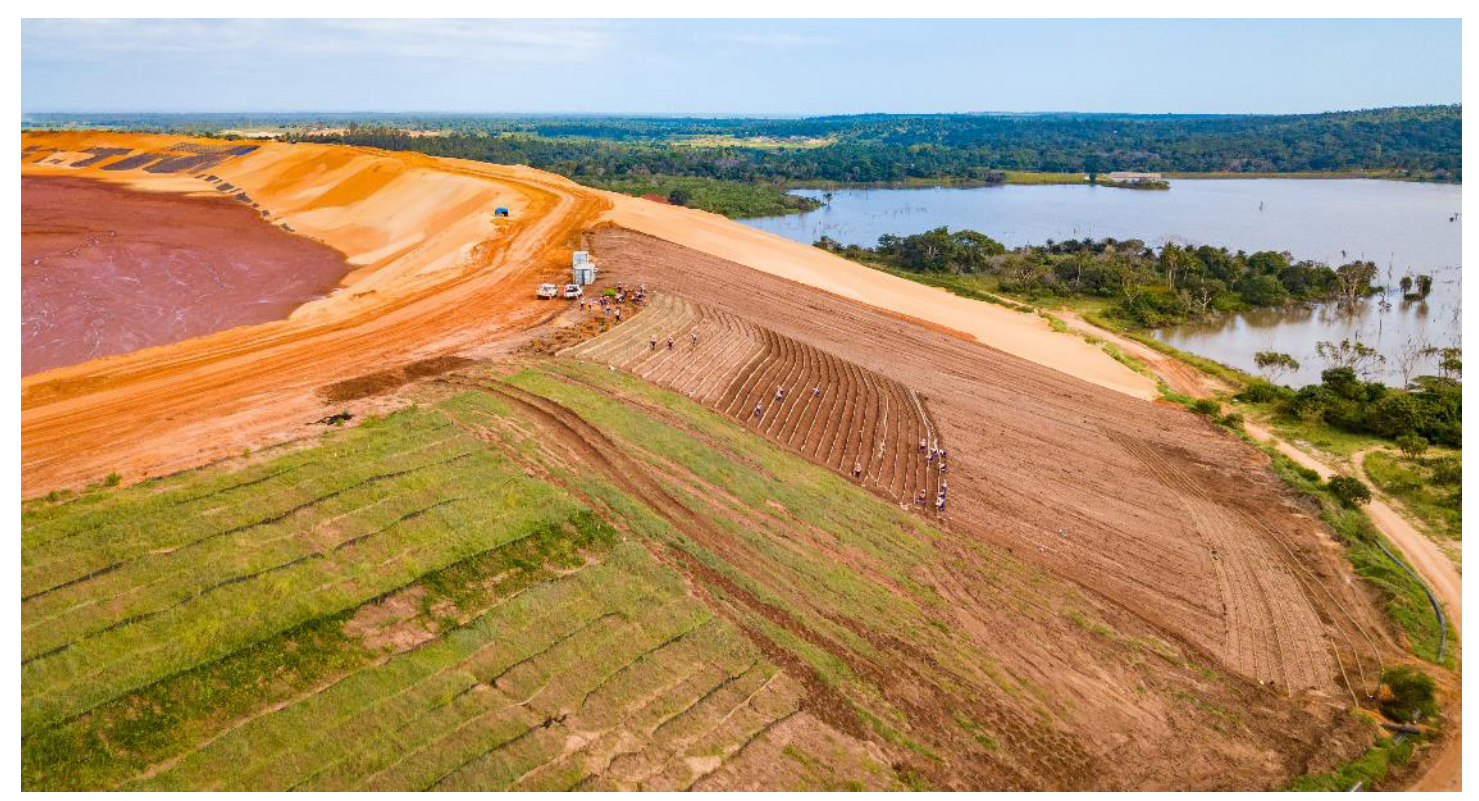
Rehabilitation works at the TSF with the Mukurumudzi Dam in the background.

The tailings storage facility ("TSF") sand wall stacking, lining and slimes deposition continued according to plan, with the final wall lift now underway. Once this lift is complete, sand stacking will move to the mined-out area of the Central Dune representing the start of rehabilitation in this section. Rehabilitation of the TSF outer wall continued during the quarter with 15,000m² vegetated to date.