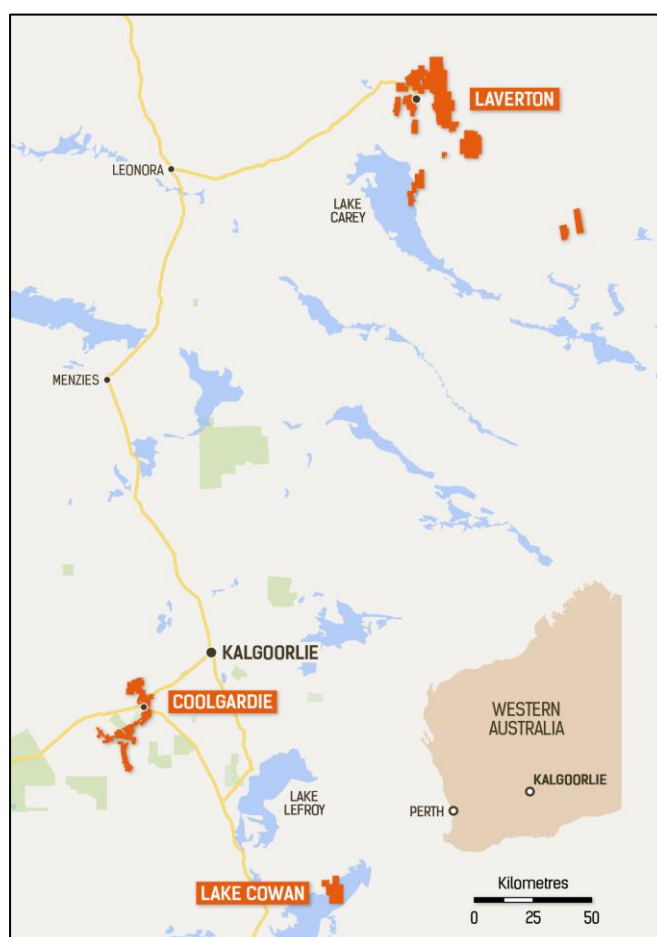
Figure 1: Focus project locations.

Focus’ cash remains strong at the end of the September Quarter, at $54.7M. The strong cash balance enables the Company to pursue the dual strategy of ongoing exploration at both Coolgardie and Laverton as well as planning for a potential restart of operations at Coolgardie.