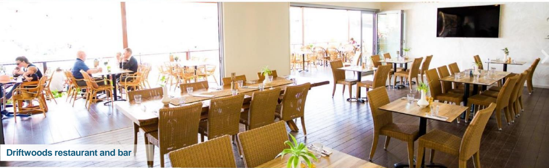
Driftwoods restaurant and bar