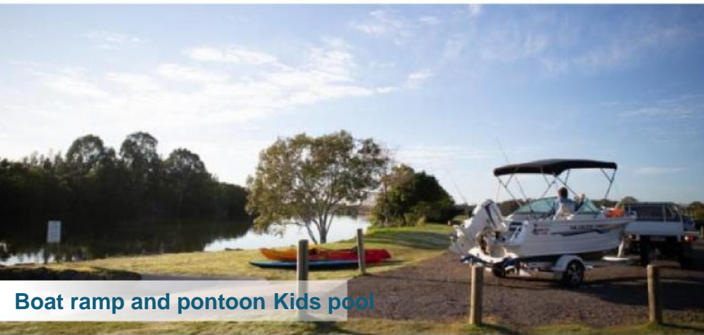
Boat ramp and pontoon Kids pool