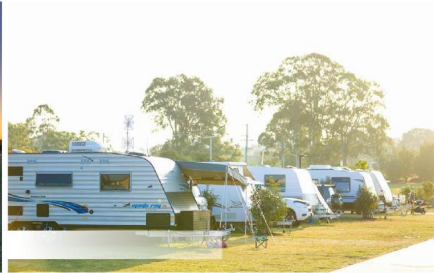
Clamping tents Caravan and camp sites