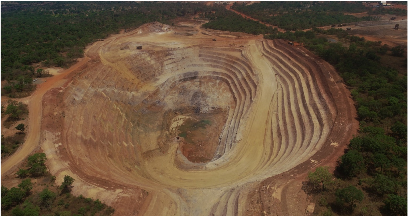
Figure 3: Stage 1 of Namakan Pit at Tabakoroni (north view); stripping of Stage 2 of the pit is underway (top of image)