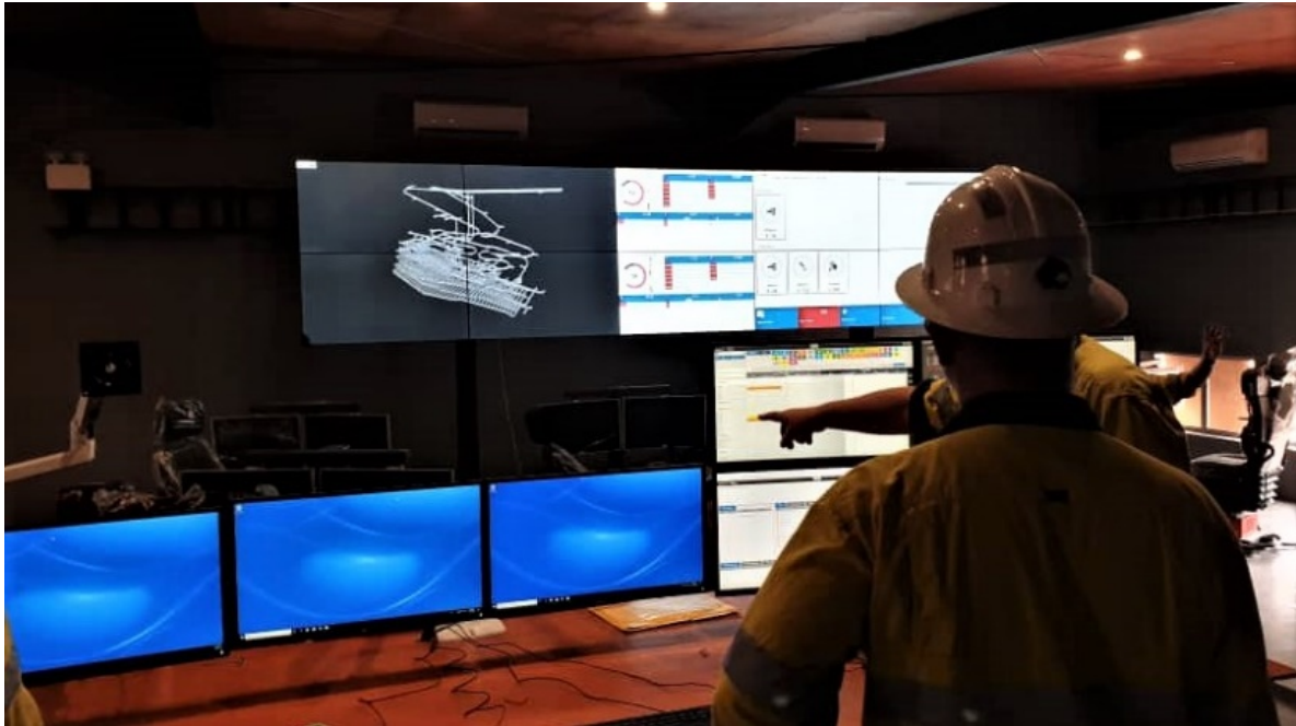
Figure 2: Automation Control Room for the Syama Underground Mine