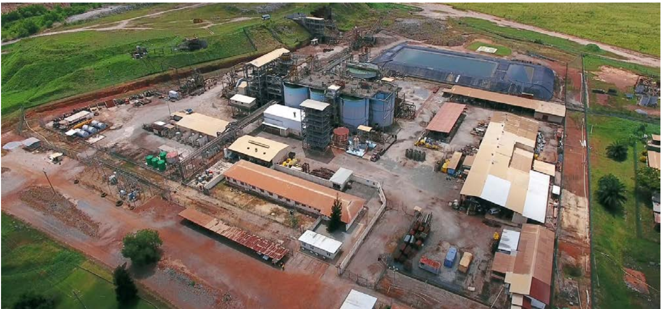
Figure 6: Bibiani plant and offices

This work will continue in the June 2019 Quarter and will inform a Final Investment Decision on the recommencement of operations.