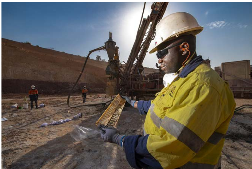
Figure 1: Drilling activities at the Tabakoroni Open Pit Mine

“We remain on track to achieve our production guidance for the 12 months through to 30 June 2019 of 300,000 ounces of gold at an All-In Sustaining Cost of A$1,280/oz (US$960/oz). I am pleased with current operating performance and optimistic that 2019 will be a pivotal year for the Company as we ramp-up our Syama operations, optimise the Ravenswood Expansion Project, and deliver on an ambitious growth agenda.”