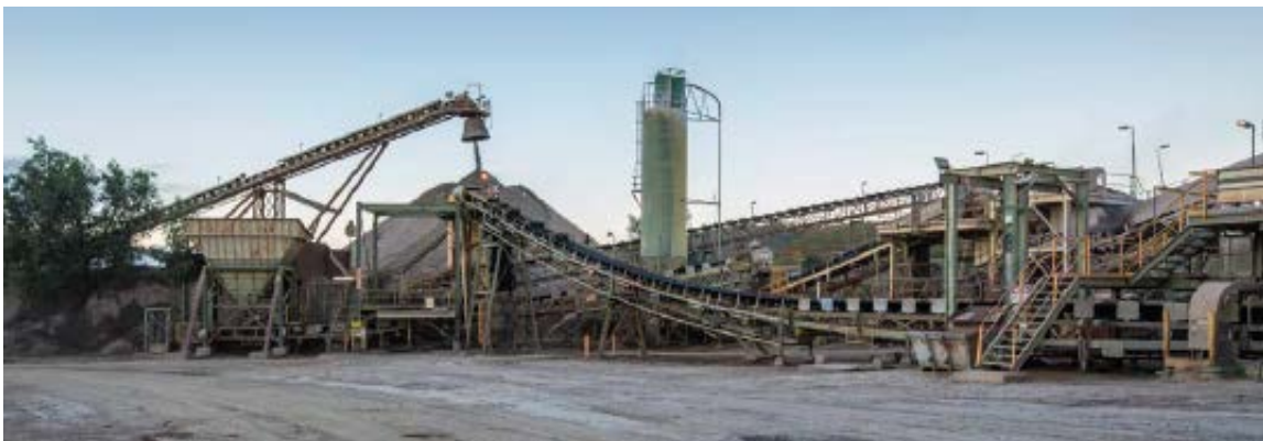
Figure 5: Nolans Processing Plant at Ravenswood

The Company continued to advance its strategic review of the Ravenswood Expansion Project during the quarter. This work has built upon previously announced study results and is expected to result in higher rates of throughput and gold production, lower costs and longer mine life.