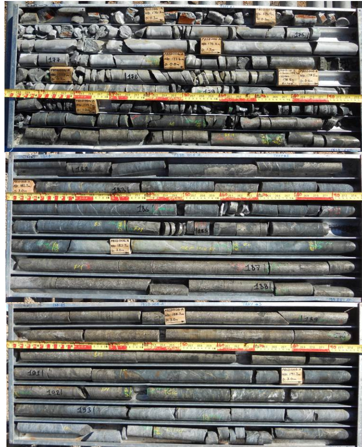
Figure 2: Core from PBSD006A showing massive sulphide mineralisation outside of the current resource