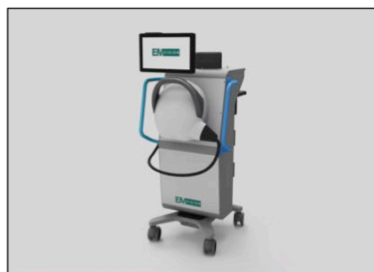
Concept image of clinical trial unit