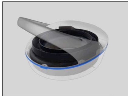
Figure 2 – Concept Image of headset in outer skin