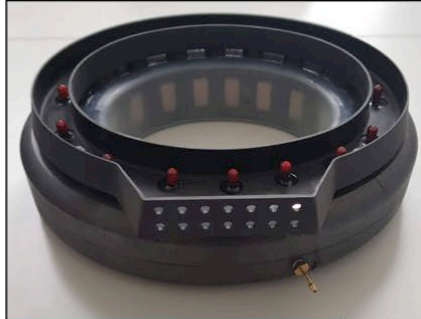
Figure 1 – Actual headset and antenna array