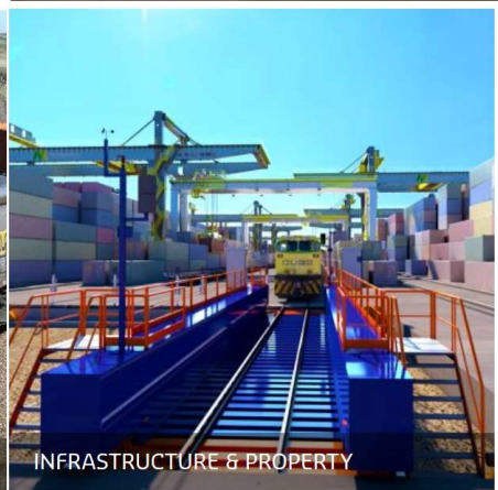
Figure 1: QUBE Transport, Logistics, Infrastructure Divisions