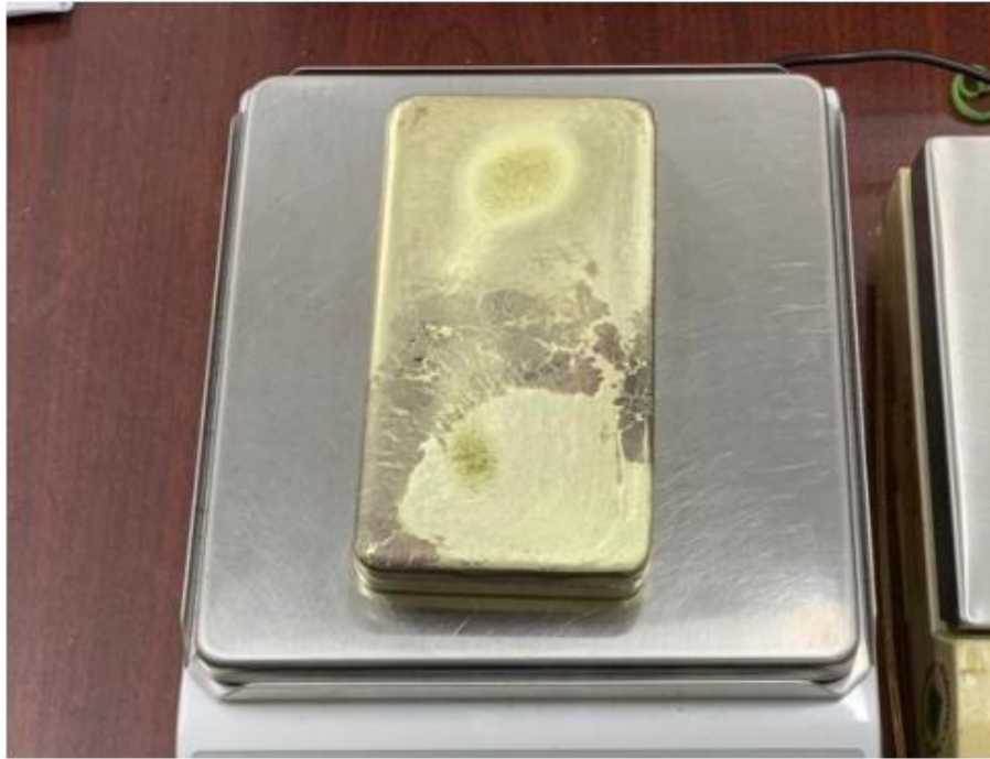
Gold bar (5.08Kg purity 99.9999%) post-refining at Hong Kong refinery