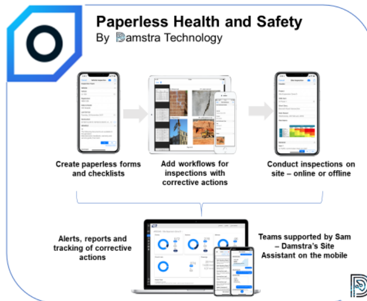
Table: Digital form and workflow management

APE’s paperless collaboration tool and enhanced, digital site intelligence introduces a new capability to the Damstra product suite and reinforces the value of Damstra’s proposition of “real time” data availability and insights. The key applications of this solution are safety and compliance requirements ranging from inspections & audits, risk assessments, incident & hazard management and health and safety audits.