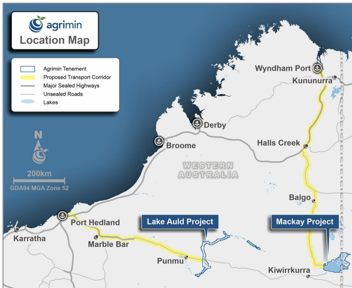
Figure 1. Project Map

Agrimin Limited (ASX: AMN) (“Agrimin” or “the Company”) is pleased to advise that it has acquired a 100% interest in the Lake Auld Potash Project in the East Pilbara region of Western Australia (Figure 1).