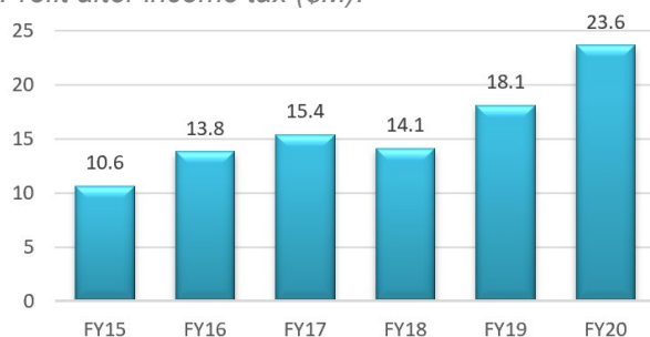
Profit after income tax ($M):