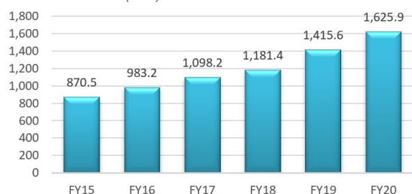
Total revenue ($M):