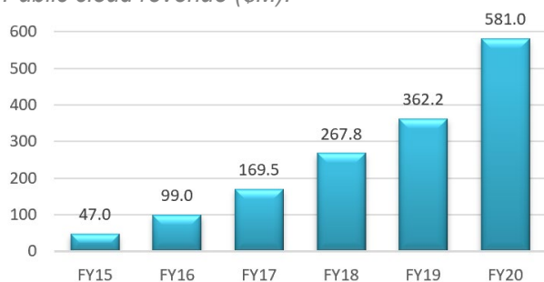
Public cloud revenue ($M):

Data#3 is Microsoft's largest reseller in the region, and our cloud services strategy contains major elements of Microsoft's product offerings such as Azure, Office 365 and Dynamics 365. Microsoft is taking the lead in public cloud globally and locally, and we are in a prime position to capitalise on market growth. At the base level, cloud services annuity revenue with Microsoft subscription licenses is a substitute for our traditional license business. Our role is to help our customers migrate applications to the most appropriate cloud solution. This may include private or hybrid cloud where customers can use a mixture of cloud services and software and manage both with a common set of tools. Vendors such as Cisco, Microsoft, HP and Dell Technologies are major players in this market segment. Data#3 is a dominant reseller for each of these global vendors. An ideal engagement would see us provide services at every stage of our solution life cycle: consulting, design and implementation, and managed or support services for both public and private clouds.