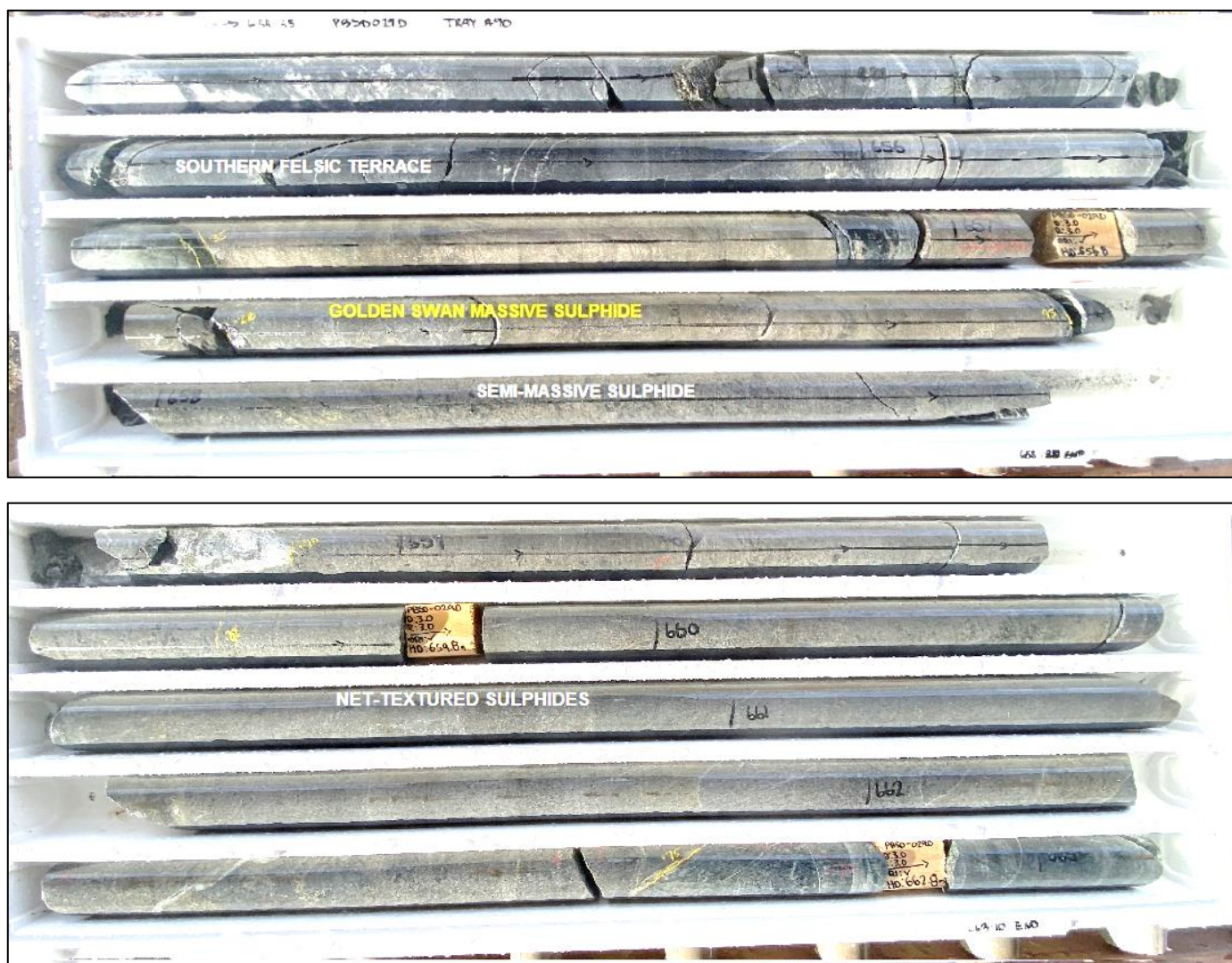
FIGURE 2 - LATEST GOLDEN SWAN MASSIVE SULPHIDE INTERSECTION IN HOLE PBS0029D

The core had been geologically logged and will now be cut and assayed. The intersection occurred at the contact between the Black Swan mineralised komatiite flow and the underlying felsic unit. The stratigraphic contact is termed the “Southern Terrace” and was identified as a significant exploration opportunity by the Company, just 300m to the South of the Silver Swan workings.