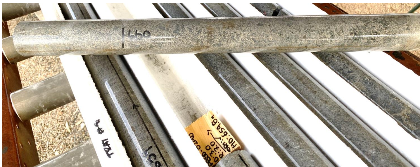
FIGURE 3 - NET-TEXTURED MATRIX NICKEL SULPHIDES WITHIN THE BLACK SWAN MINERALISED FLOW UNIT

Poseidon's MD & CEO Peter Harold commented, "This is another outstanding drill result at Golden Swan and demonstrates the enormous potential of the Southern Terrace. The Company has committed to the Golden Swan Drill Drive and WestAuz Mining is in the process of mobilising to site with the first cut on track for early December. Tender submissions for the resource drilling contract are due on 20 November, with strong interest shown. The new drill drive we also be an ideal position to drill test the Southern Terrace and see if there are additional mineralised zones. We are also in a unique position to be able to drill out the Golden Swan mineralisation quickly and then determine the most appropriate way to exploit this mineralisation, should it prove to be economic."