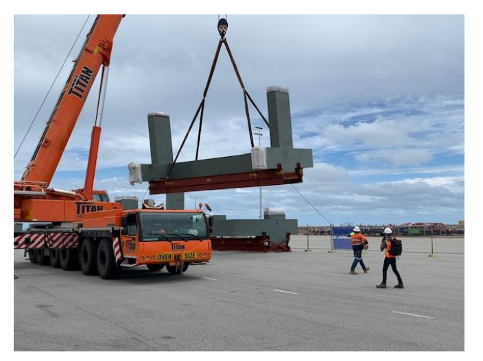
Shaft headframe sections being offloaded