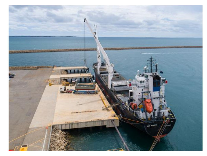
BBC NYHAVN being offloaded at Henderson port

The headframe, winder and associated infrastructure components are currently at the Henderson port in WA and are awaiting customs clearance prior to transportation to the Odysseus mine site. This is a major achievement for the Odysseus project and largely de-risks the shaft establishment schedule. Only minor engineering design support works remaining to be completed in South Africa. All future works will be allocated to local engineering groups in WA.