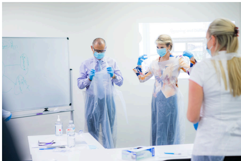
Images 1 & 2: Senator The Hon Michaelia Cash (Minister for Skills, Small and Family Business) at the first Infection Control Training course at the Sero Institute Osborne Park Individual Support Training Campus