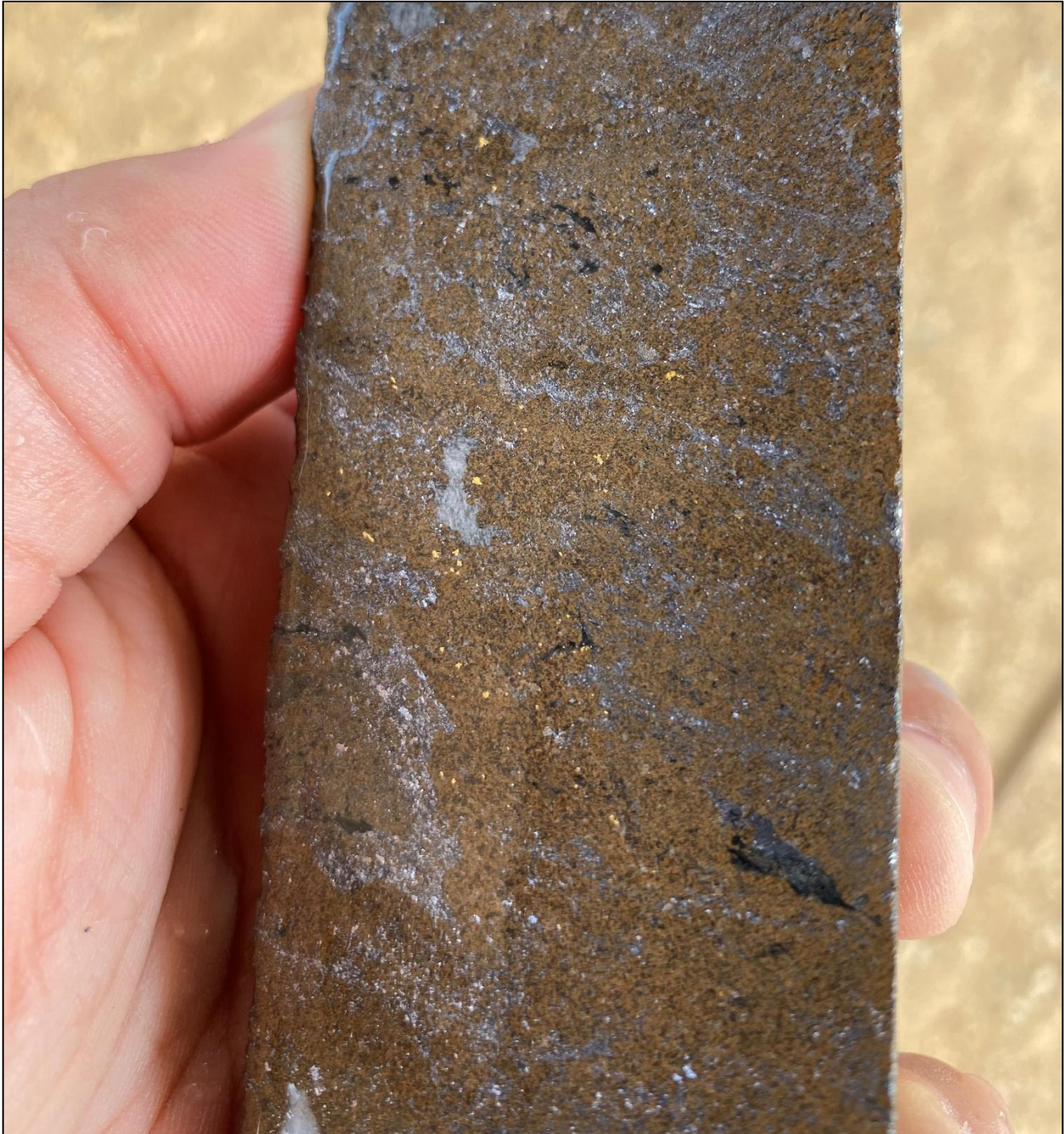
Figure 2. Massive sulphide mineralisation from FDD107W1 comprising sphalerite (brown) and galena (grey) with abundant visible gold disseminated throughout (yellow). The photograph forms part of a one-metre interval grading 237g/t Au, 45.5% Zn, 19.8% Pb and 12g/t Ag.