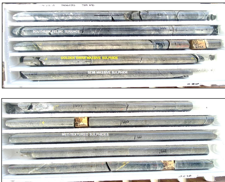
FIGURE 2 - GOLDEN SWAN MASSIVE SULPHIDE INTERSECTION IN HOLE PBS0029D

During the quarter the Company intersected the Golden Swan mineralisation 50m up plunge of hole PBS0030B, with drill hole PBS0029 returning 6.4m (3.7m true width) @ 9.60% Ni on Southern Terrace basal contact including 1.6m (0.9m true width) @ 14.89% Ni . This third intersection continues a series of high grade nickel sulphide intersections at Golden Swan over a 170m dip extent (refer to ASX Release dated 19 November 2020).