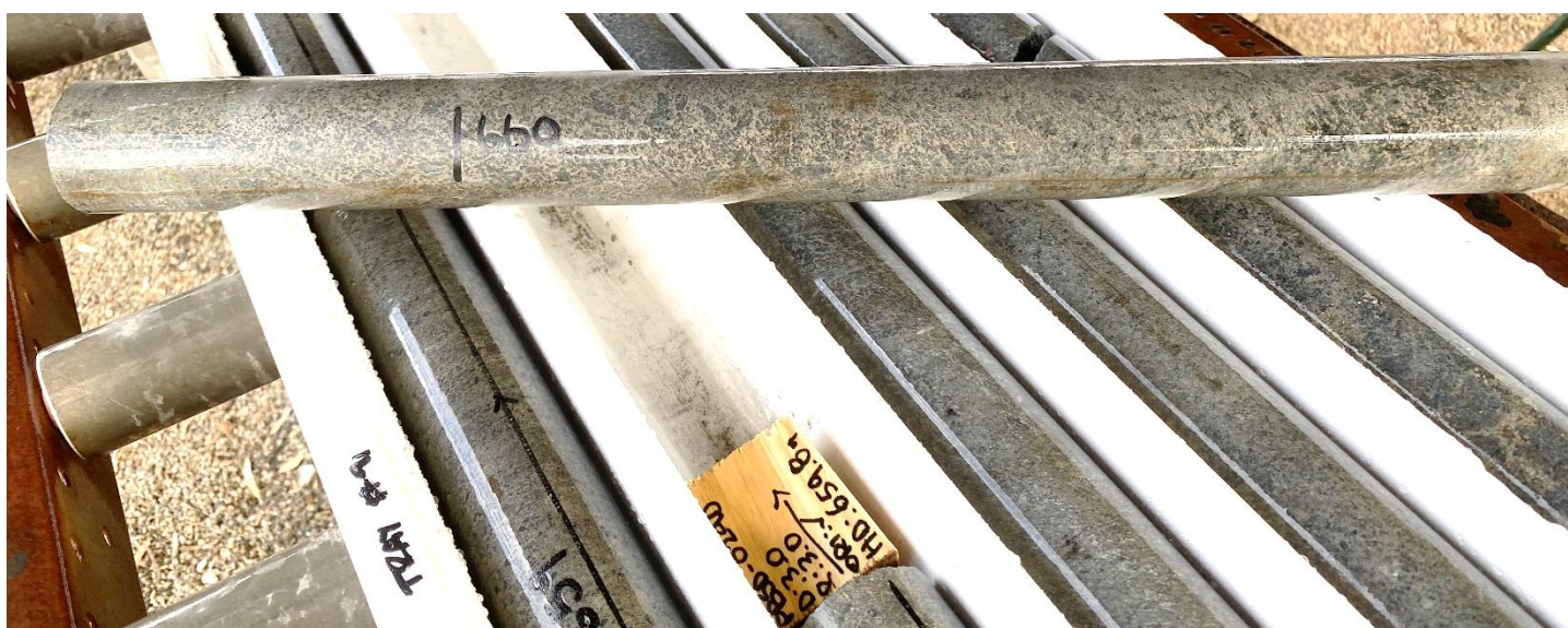
FIGURE 3 - NET-TEXTURED MATRIX NICKEL SULPHIDES WITHIN THE BLACK SWAN MINERALISED FLOW UNIT

This latest and highest intersection confirms that the additional DHEM responses are due to the presence of nickel sulphides (refer Figure 1). Hole PBSD0029D may also indicate that the previously identified separate DHEM plates outlining the known Golden Swan mineralisation are a continuous horizon of nickel sulphides accumulating upon the Southern Terrace.