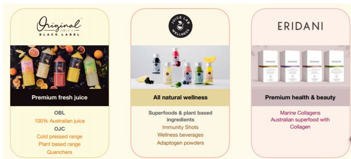
Figure 1: FOD product Range

The Original Juice Black Label products continue to grow market share with a growth of 18% over the period. OBL continues to outperform fresh juice market, increasing our share to 13% of the $560m market.