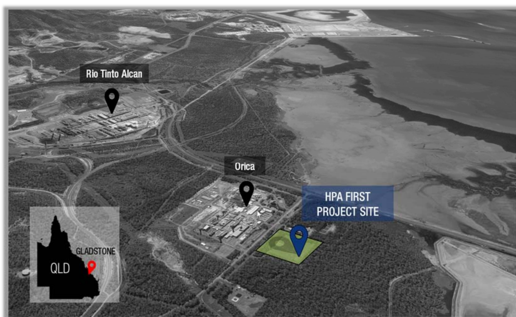
HPA First Project Site – GSDA Development Permit has now been approved

Working with permitting consultants, AECOM, Alpha is currently completing the applications and supporting studies for the EA, with EA approval anticipated in the June quarter 2021.