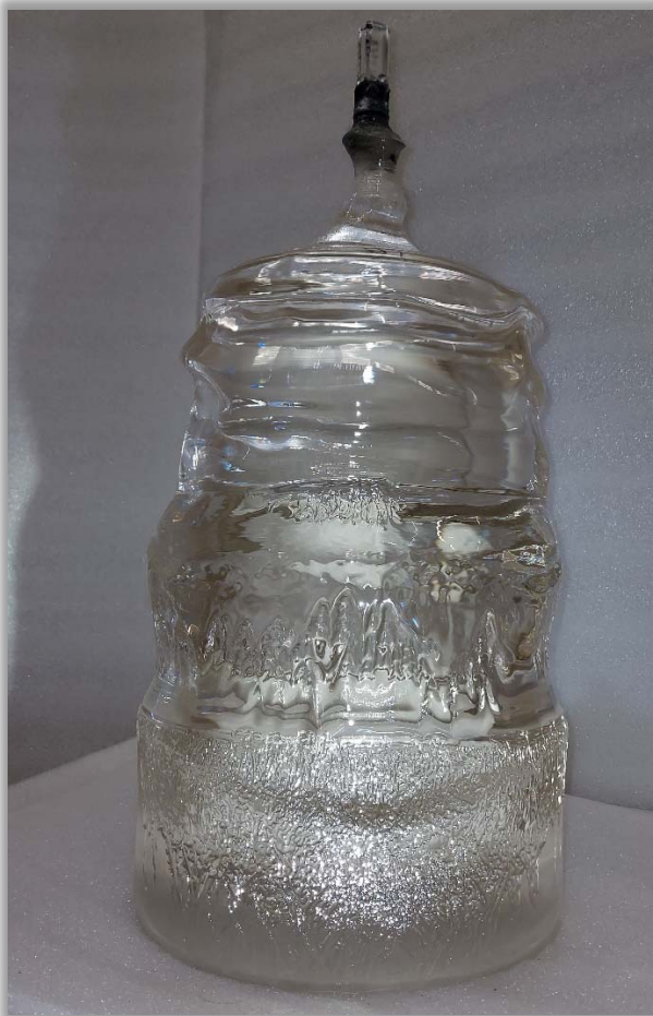
~90kg single crystal sapphire glass boule grown by ALOX using Alpha’s HPA pellet feedstock

Alpha and ALOX are now in discussions on the commercial supply of high purity alumina pellets.