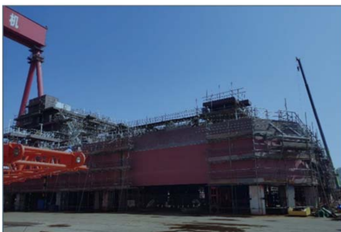
Main Hull with Living Quarter assembled (May 2021)

The WZ12-8E platform (HYSY163) is being fabricated in Qingdao, China. A total of 46 sections are under fabrication with 15 sections, forming the hull and living quarters, now assembled. Platform construction was 67% complete at the end of May, with sail away into the field scheduled for July 2021. The photos below show the HYSY163 platform construction site.