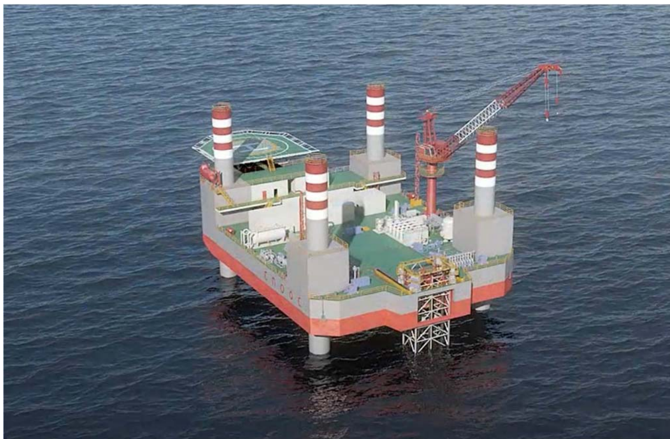
Artist's impression of the HYSY 163 platform once completed

Excellent progress is being made in the construction and procurement phases of the WZ12-8 East development, under the management of our JV partner, Roc Oil (China) [ROC]. The main components of the WZ12-8E development include a standalone self-installing platform (HYSY163), 7 development wells [6 producers and 1 water disposal well], an 8 km subsea pipeline and cable connecting to the existing WZ12-8W wellhead platform. Production from WZ12-8E will combine with WZ12-8W production and flow via the existing infrastructure to the PUQB platform for processing and export.