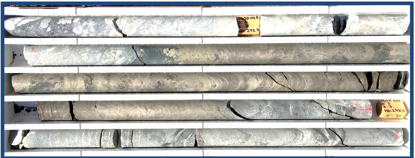
FIGURE 1: 2M OF MASSIVE SULPHIDE SEEN IN PGSD025 (awaiting assays).

Poseidon Nickel (ASX: POS) (“Poseidon”, “the Company”) is pleased to provide an update on the Golden Swan resource drilling program.