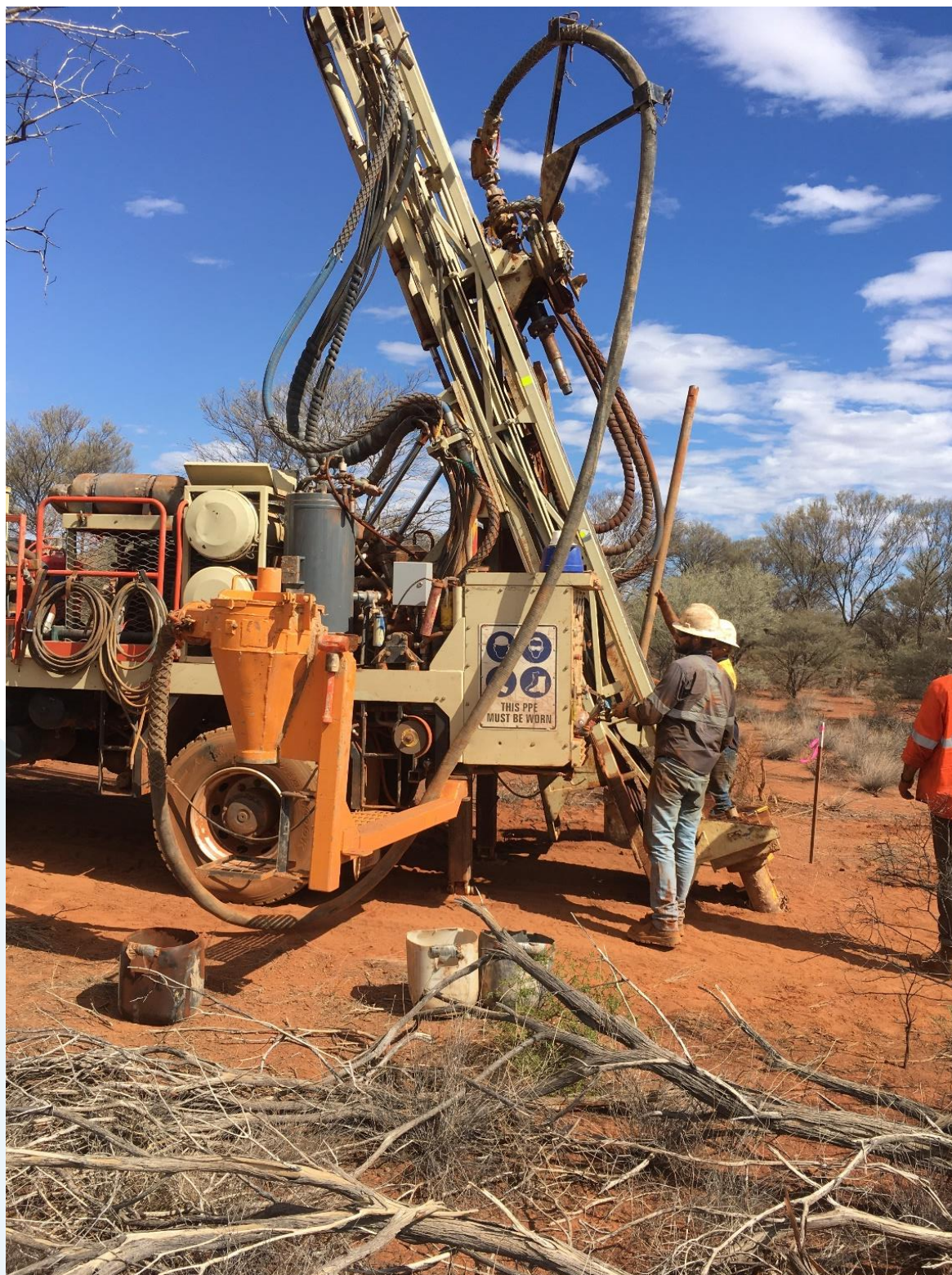
Figure 3. Aircore drilling of regional targets at Youanmi is underway.