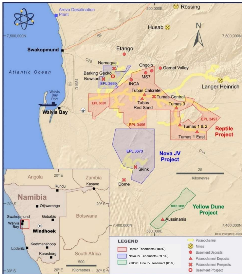
Figure 1: Location of the Nova JV EPLs 3669 and 3670.

TN258RC ended in mineralisation at 253m depth and could not be continued due to the lack of drilling rods available on site. Drilling will extend this hole at a later date, when drilling rods become available.