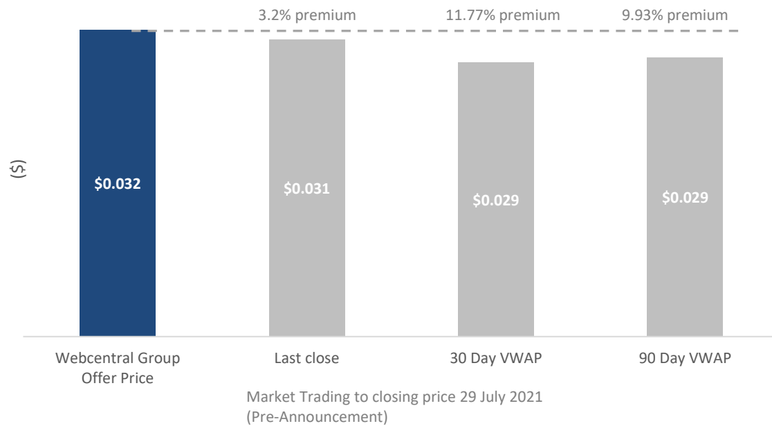
Figure 1: Webcentral have offered a low premium of only 3.2% to Cirrus pre-announcement share price($)

Note: Numbers in the chart above have been rounded.