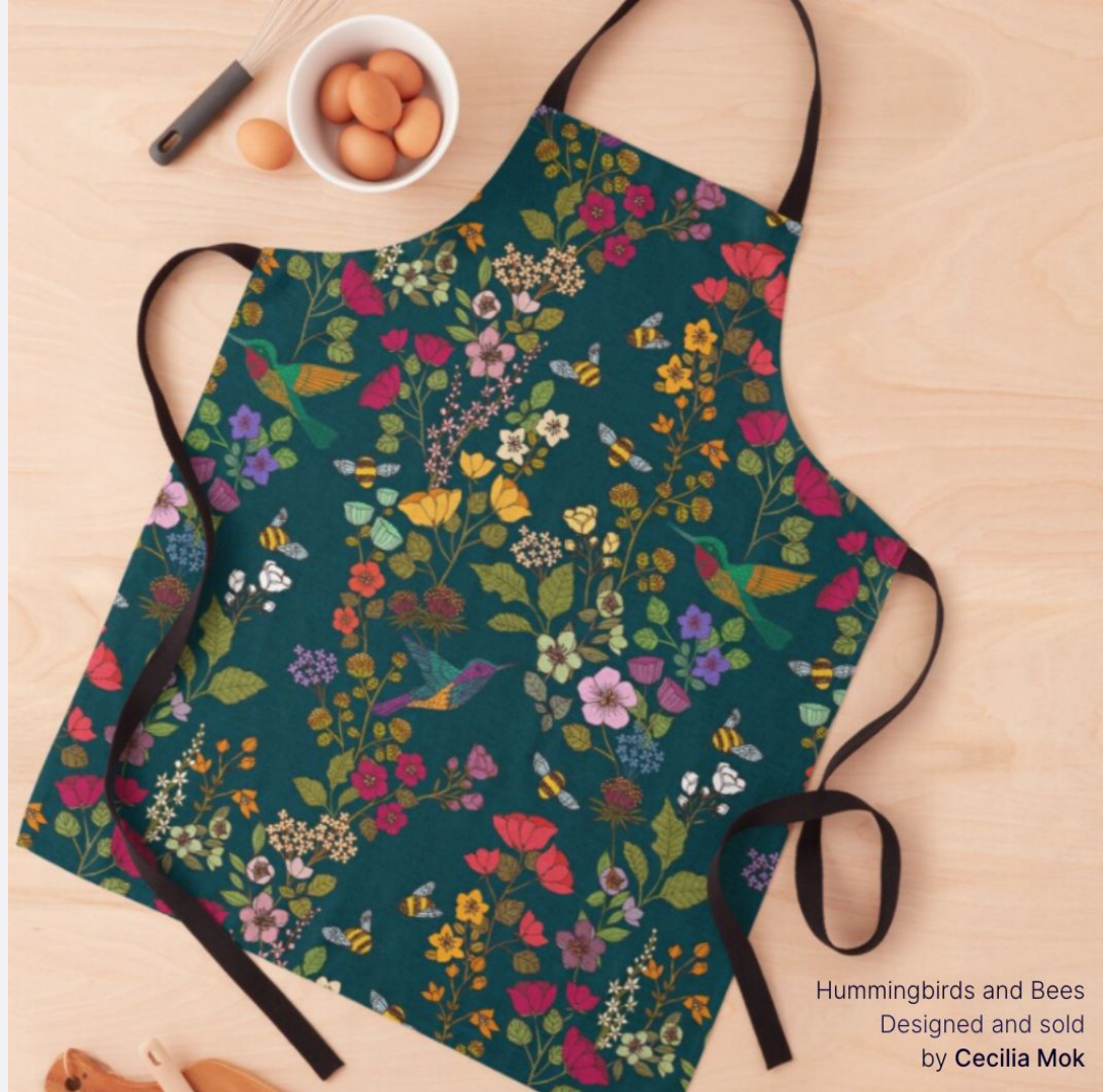
Hummingbirds and Bees Designed and sold by Cecilia Mok