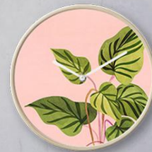
Spring Desert Night, Tropical Rising Pink and Green Plant Designed and sold by moderntropical