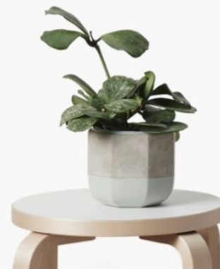
Two Comets by Pikaole