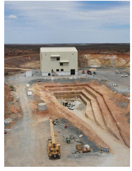
Raise bore machine site and winder house construction

Furthermore, significant work has been completed at the winder house facility, which will allow the winder to be installed early in 2022, after which mechanical, electrical and hydraulic fit out will commence.