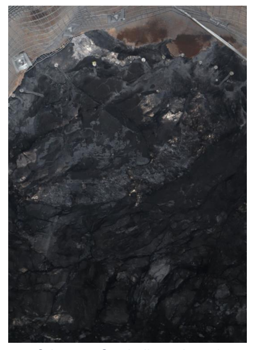
Odysseus South disseminated sulphide ore face

The first development ore at the Odysseus south orebody marks a significant milestone for the Company's new long life nickel mine. The ore will be stockpiled during construction of the concentrator complex, which is due to produce first concentrate in the December quarter of calendar year 2022. Western Areas is also assessing options for potential ore tolling arrangements in the short term.