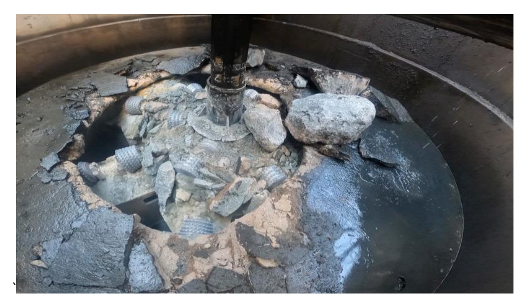
The raise bore head breaking through at surface

A shaft laser survey has been completed following the surface breakthrough, indicating that the shaft barrel vertical alignment is well within design tolerance of 200mm. The laser survey will now be followed by a LIDAR survey and camera inspection, which will provide a 3-D profile of the shaft excavation. Civil works can also commence to construct the sub-brace walls, followed by the installation of the services ducts, which will allow chilled air and services to be channelled into the intake shaft.