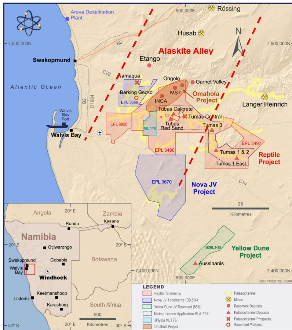
Figure 1: EPLs 3496, 3497 showing Tumas deposits and main prospect locations over palaeochannels.

Exploration work will focus on establishing the full potential of the basement targets associated with the Omahola project to unlock further value for Deep Yellow.