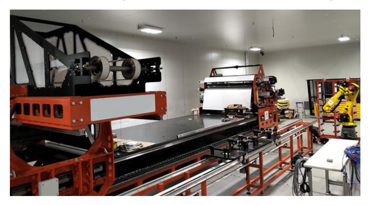
Above image: Production click press now on site.

The delivery of the first production cutting press machine was a significant industrialisation milestone during the quarter. The production-scale machine is expected to be a big step forward in the efficiency of our ply cutting technology. The machine was developed with a local equipment partner and follows from the significant learnings derived from the earlier prototype cutting presses. This press is now being commissioned ahead of the introduction of it to new programs.