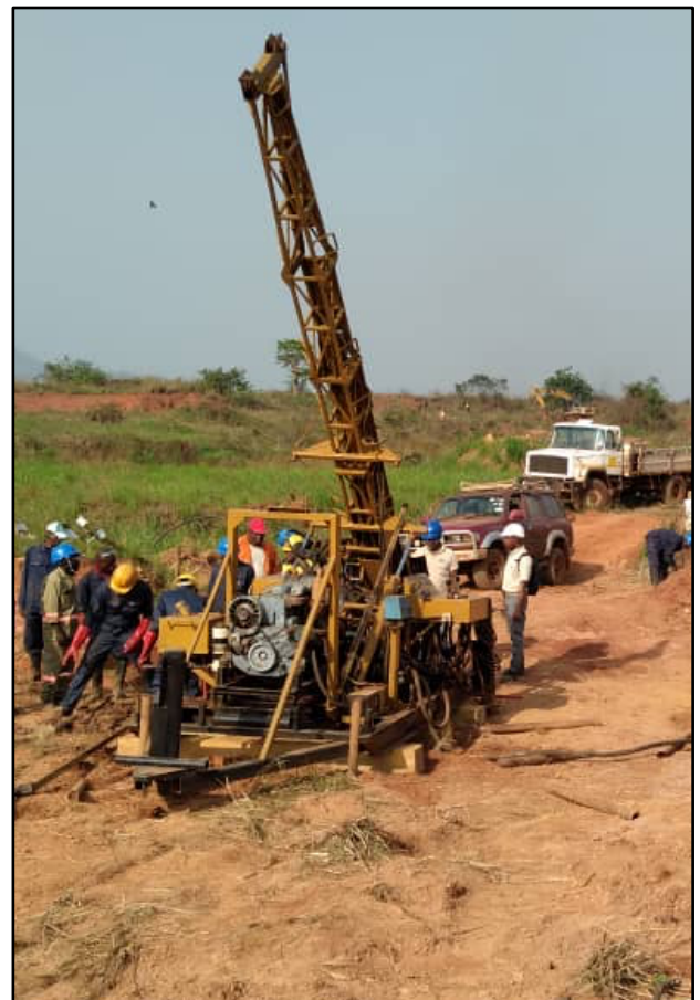
Figure 1 – Amani Gold drilling at Kebigada (GRDD036)

Drilling is scheduled to be completed in early 2022.