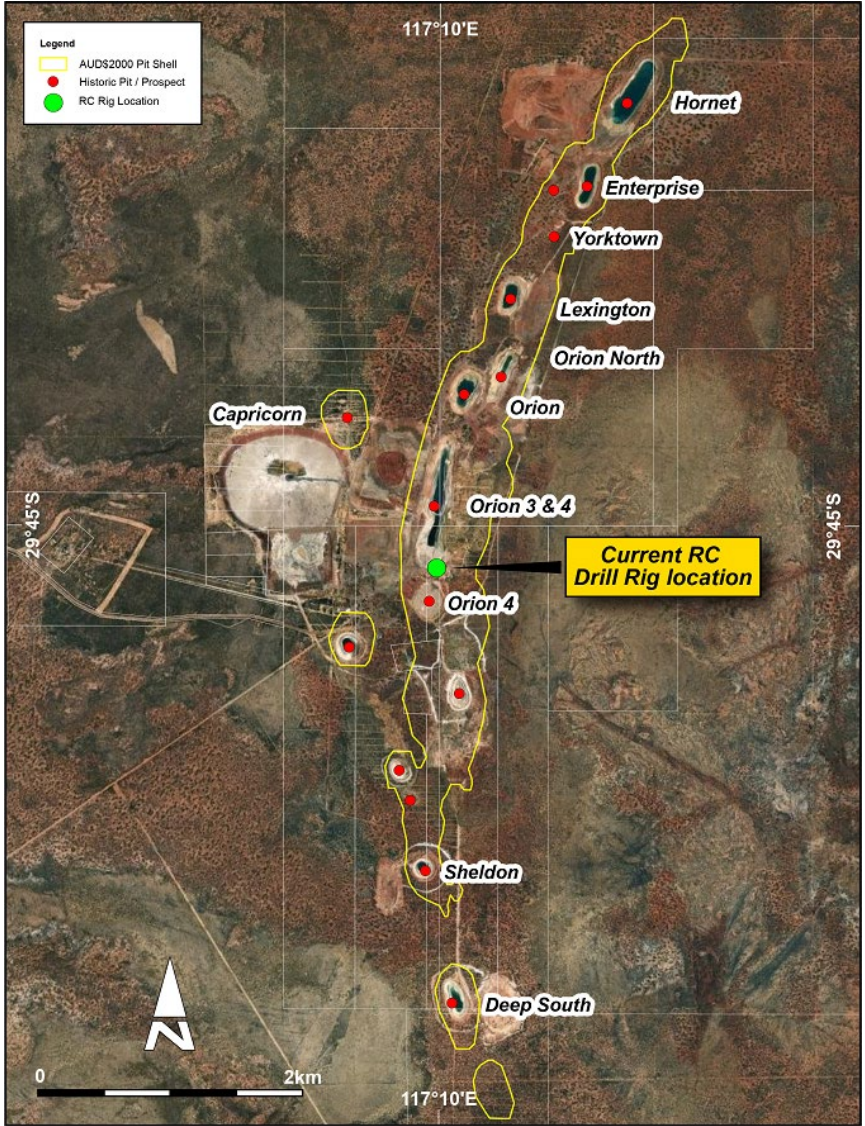
Resource shells, historical pits and current drilling location

Drilling has commenced in the area of the historical Orion 3 and 4 pits.