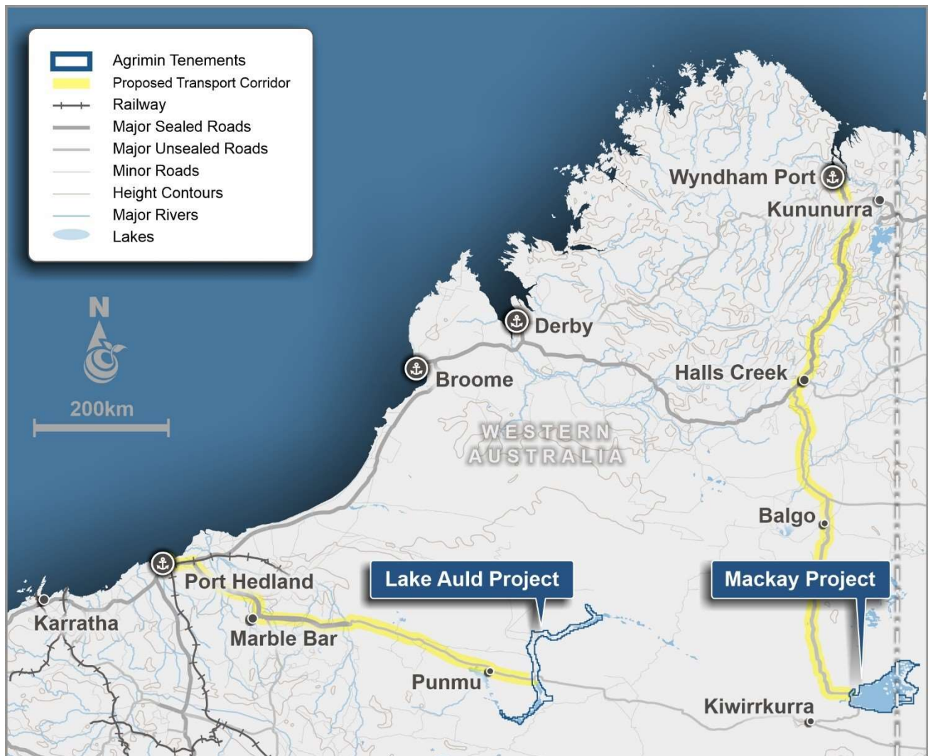
Figure 1: Map of Agrimim's Projects

The Project is located 940 kilometres by road south of the Wyndham Port in Western Australia (Figure 1). It comprises nine granted Exploration Licences covering over 3,000 square kilometres in Western Australia and four Exploration Licence applications covering over 1,200 square kilometres in the Northern Territory.