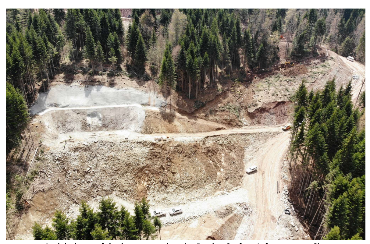
Aerial photo of the lower portal at the Rupice Surface Infrastructure Site

Ground support installation around the lower portal to the Rupice underground mine has been completed and decline development is expected to commence in the coming weeks. Excavation of the upper portal is ongoing and ground support installation is expected to start in the coming weeks, with decline development ready to start at the end of the quarter.