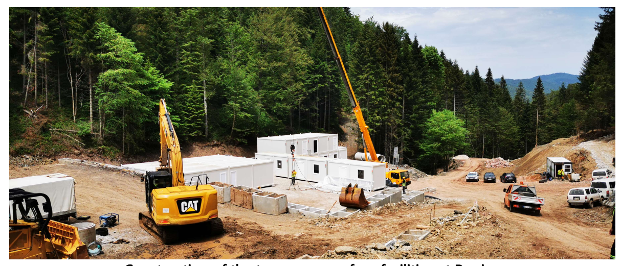
Construction of the temporary surface facilities at Rupice

Çiftay İnşaat Taahhüt ve Ticaret A.Ş. ("Ciftay"), the Company's appointed underground mining contractor, has started its initial mobilisation of mining equipment and workshop facilities to site. By the end of this quarter, the initial phase of mobilisation will have been completed. This includes the mobilisation of equipment for the first phase of mining, as well as the installation of temporary surface facilities (offices, warehouse and workshops). Over the next 12 months further supplementary equipment will be mobilised, as required for the subsequent second and third phase of mining.