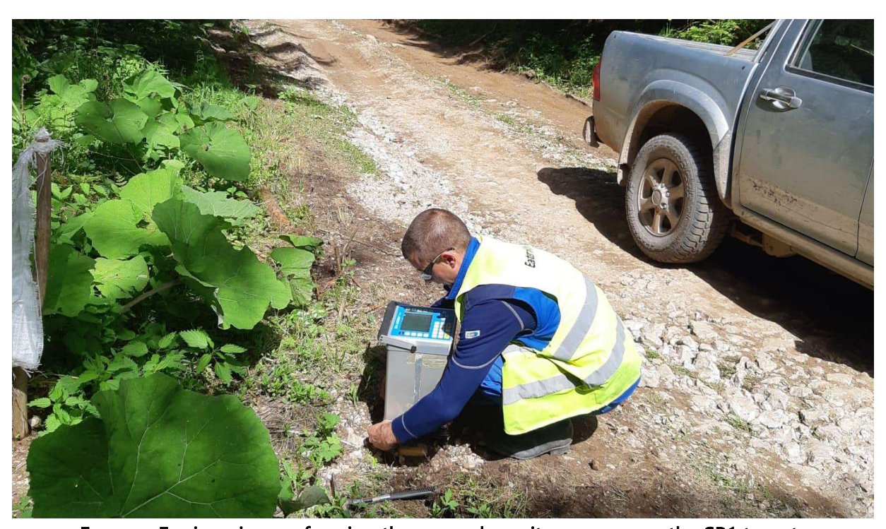
Enerson Engineering performing the ground gravity survey near the SP1 target

Concurrently, the field exploration activities continue across the 42 km<sup>2</sup> Vares Concession area with field mapping and ground gravity surveys being the main activities.