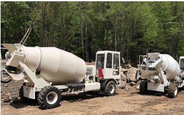
Underground concrete mixer trucks, jumbo & excavator will be used during the first phase of mining for decline construction

Çiftay İnşaat Taahhüt ve Ticaret A.Ş. ("Ciftay"), the Company's appointed underground mining contractor, has started its initial mobilisation of mining equipment and workshop facilities to site. By the end of this quarter, the initial phase of mobilisation will have been completed. This includes the mobilisation of equipment for the first phase of mining, as well as the installation of temporary surface facilities (offices, warehouse and workshops). Over the next 12 months further supplementary equipment will be mobilised, as required for the subsequent second and third phase of mining.