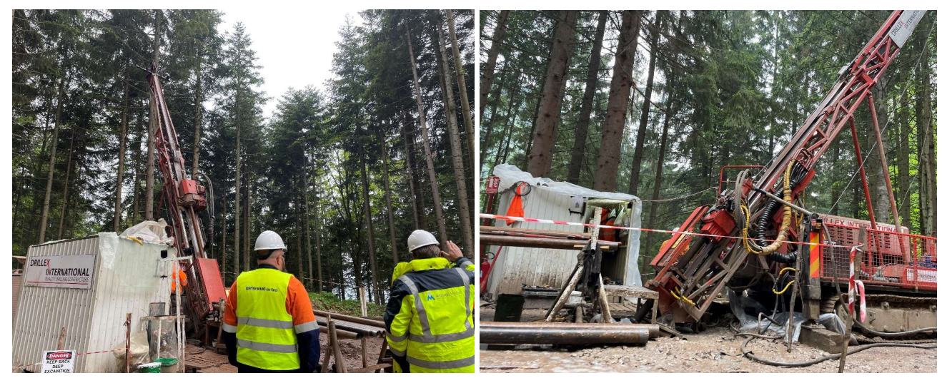
Drillex International diamond core drilling rigs operating near Rupice

Of the three rigs that Drillex have mobilised to the Vares Project site, two rigs are currently deployed for resource definition drilling within the central part of the Rupice deposit, and one rig is stepping out along the northwest extension of the Rupice deposit.