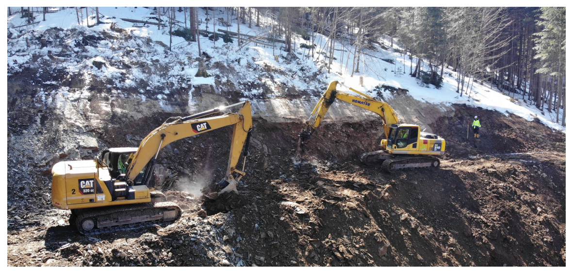
Haul road construction at Lot 1