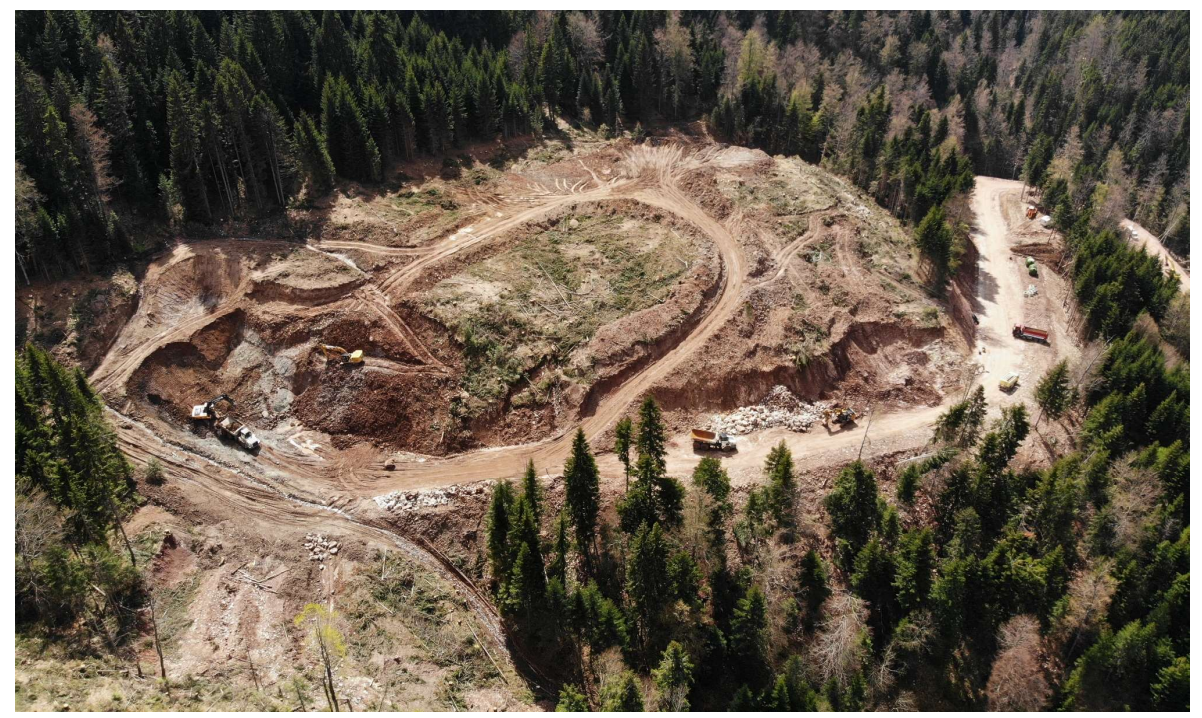
Aerial photo of the upper portal pad at the Rupice Surface Infrastructure Site

The imminent start of construction of the lower decline will mark the start of the three phases of mining at Rupice. The first phase is the concurrent construction of the two declines from the upper and the lower portal, down to the two parallel production levels of the Rupice orebody. The first phase is expected to be completed during Q4 2022.