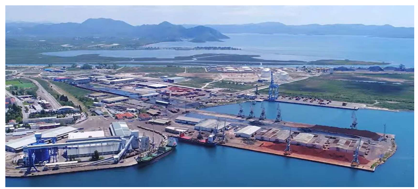
Aerial view of the container terminal (far side) and bulk terminal (centre & left) at the port of Ploce

A site visit to the deep-water port of Ploce in Croatia took place earlier this month ahead of a planned engineering survey next month. The result of the survey will confirm the most practical areas within the port as well as a report on the available infrastructure in place and any upgrades that may be required.