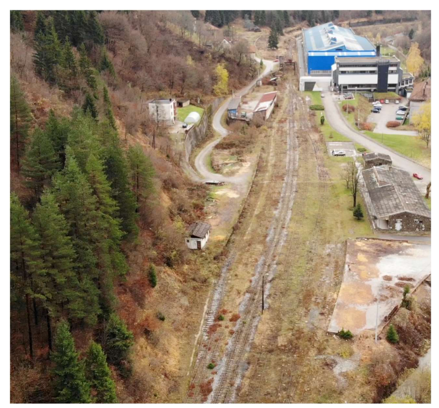
Drone photo of the Vares Majden Railhead

An independent survey is due to be conducted within the next month on the 25km of dedicated rail line from Vares Majden to Podlugovi, south of Breza, where it connects to the wider domestic Bosnian railway network.