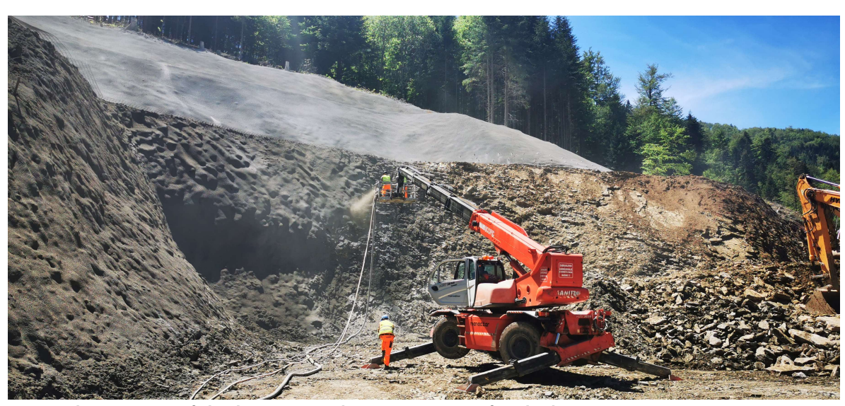
Shotcreting of the lower portal in preparation for decline construction to start

The imminent start of construction of the lower decline will mark the start of the three phases of mining at Rupice. The first phase is the concurrent construction of the two declines from the upper and the lower portal, down to the two parallel production levels of the Rupice orebody. The first phase is expected to be completed during Q4 2022.