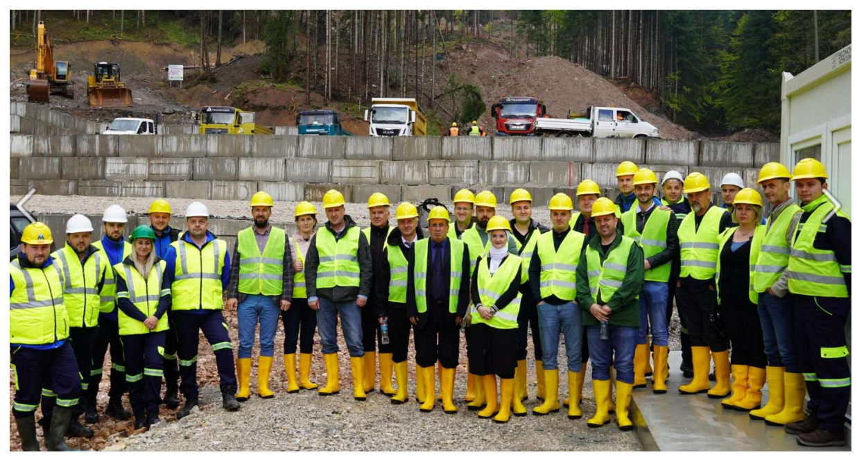
Site visit to Rupice by councillors of Vares and Kakanj Municipalities