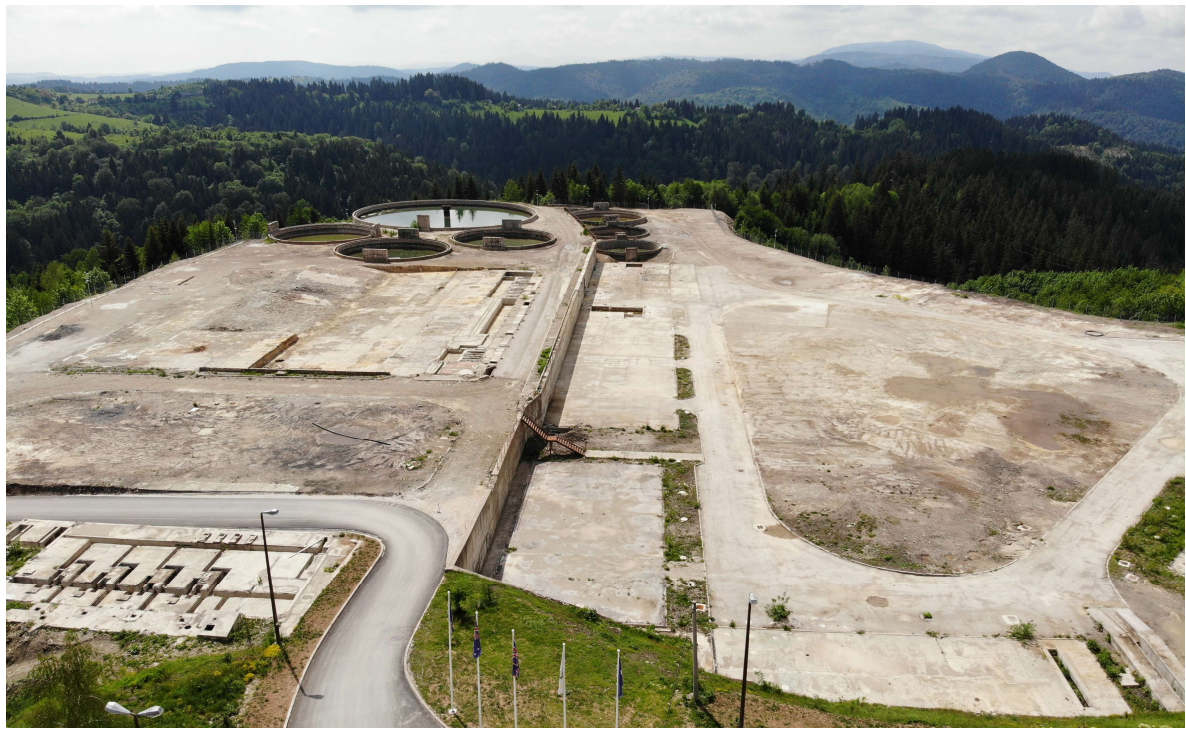
Concrete pad foundations at the Vares Processing Plant site

The contract for the preparation of the foundations for the Vares Processing Plant has been signed and work is expected to start in the coming weeks. Following the demolition in 2021 of the buildings that were formerly on the site, a number of shallow subterrain cavities and channels remained. Building of the foundations will require these shallow voids to be filled and in addition some of the remaining concrete removed. The new Vares Processing Plant buildings will be constructed on the existing concrete infrastructure from the historical processing facilities, which saves a substantial amount of time, engineering and expense. The contract for the construction of the Vares Processing Plant buildings is expected to be awarded imminently.