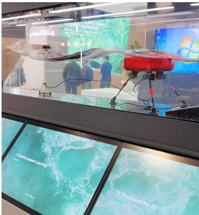
Figure 1 - HPE's CETO Tank at the ISC High Performance Conference in Hamburg, 29 May - 2 June 2022

Carnegie and HPE have been collaborating since 2020, and the work conducted by the two companies has delivered significant improvements in CETO's performance, specifically in relation to the technology's Reinforcement Learning-based controller. Reinforcement Learning is a type of Artificial Intelligence where the system teaches itself how to operate optimally. The Reinforcement Learning controller has the ability to directly learn and apply the optimum response to predicted waves, during